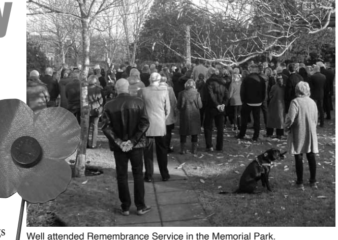
Well attended Remembrance Service in the Memorial Park. Wreaths and crosses laid on the Memorial Cross remembering the fallen of past conflicts.