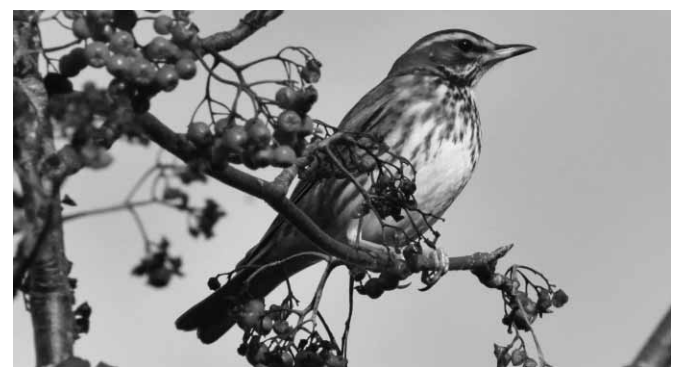
Winter visitor - The Redwing