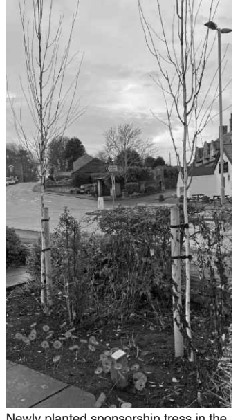
Newly planted sponsorship tress in the Memorial Park

Although they are already planted, there are a further two trees available for sponsorship plaques in the Memorial Park which are offered to the village on a first come first served basis by contacting the Parish Clerk.