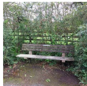
The cleared bench area

We were also able to put up anti litter and dog fouling signs on telegraph poles at various points around the village which we hope will help to prevent these antisocial activities.