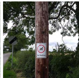
One of the telegraph pole signs

Our next litter pick will take place on Saturday 28 th March to coincide with the Great British Spring Clean 2020. Further details will appear in the March newsletter