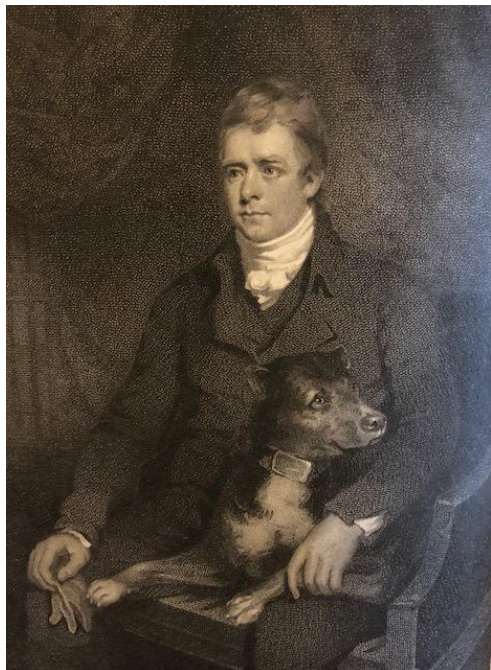
Engraving from 'The Lady of the Lake'

This year sees the 250th anniversary celebration of the birth of Sir Walter Scott, a man who put Scotland on the literary map and inspired travellers from across the world to visit and experience its magic.