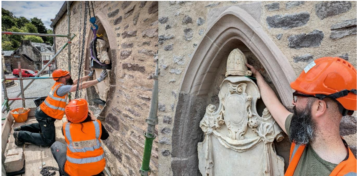
The cartouche after restoration