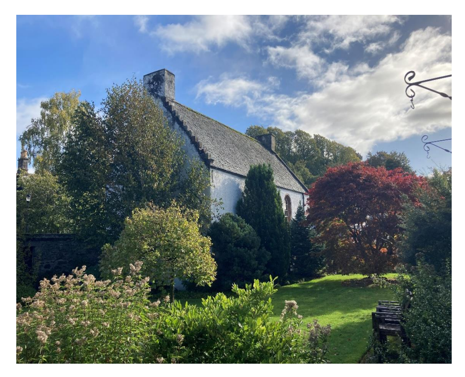
Just before the tree surgeon arrived......

The pedestrian gateway, which has been closed for years, has now been opened and a lock and door handle fitted. The water supply has also been secured with the installation of an outside tap on the wall of the old stable. Most significantly, the tree surgeons came to remove the trees at the north and east side (thank you to the reader who pointed out the directional confusion in the last issue).