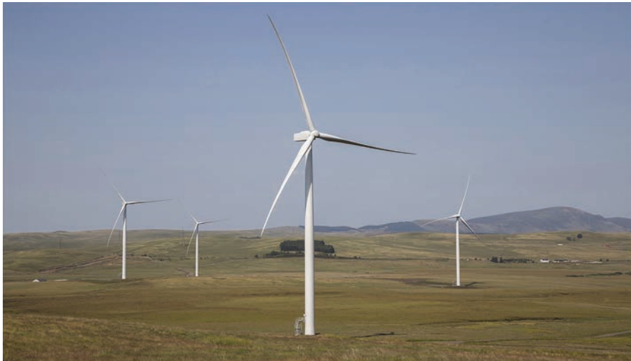
Figure 7.1 Spatial framework for wind energy

7.32 Scottish Planning Policy requires that planning authorities should set out in the development plan a spatial framework identifying those areas that are likely to be most appropriate for onshore wind farms as a guide for developers and communities. This is based on three groupings in relation to the appropriateness of wind energy development as set out in Table 7.2 and shown on Figure 7.1. and in more detail on Renewable Energy Map 1. There are no Group 1 designations in South Lanarkshire. Group 2 areas incorporate community separation areas that are two kilometres wide. Where landform or other features restrict views from the settlement, land less than two kilometres from a settlement may be considered to have potential for wind energy development. The LDP does not use the term 'wind farm', the spatial framework for South Lanarkshire applies to all turbine developments of 15m or greater in height. Further guidance on the Spatial Framework is contained in the Renewable Energy supporting planning guidance document. This document will also give consideration to strategic capacity for wind farms.