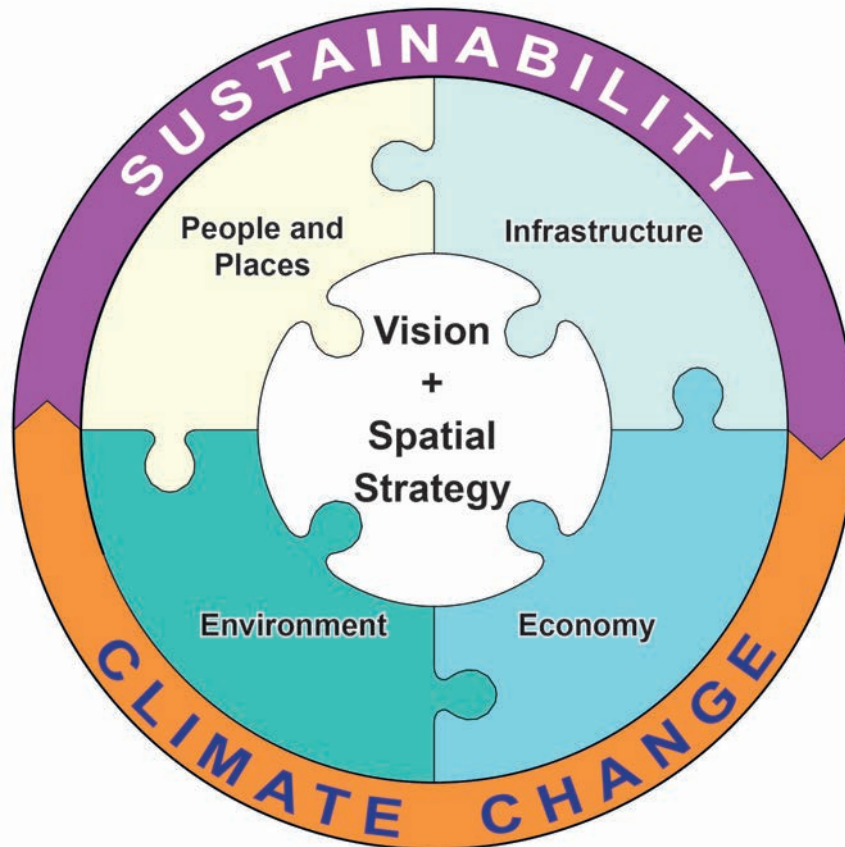
Figure 3.1 Vision and Spatial Strategy

3.16 SPP also states that LDPs should support the development of heat networks in as many locations as possible. This can include schemes that are initially reliant on carbon-based fuels if there is potential to convert them to low carbon fuels in the future. Where new major developments are planned (as defined in the development management regulations), they should incorporate the provision of a heat network on site. This should be a recognised requirement and designed at the earliest stages of the application process. A feasibility or energy statement should be submitted to establish whether district heating has been incorporated into the development, and justification of the approach taken.