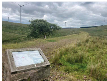
Waymarked trails for mountain or gravel biking, walking or horse riding to be developed around the Douglas Valley