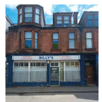
Conversion of Billy's, Lesmahagow into a Community Hub and community flats, currently supported through Place Based Investment Funds and REF, with potential to be supported by DVAG