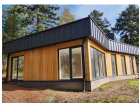
Wiston Lodge Outdoor Classroom has received support from Clyde Windfarm, LEADER, National Lottery Community Fund and REF