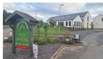
Clydesdale Community Initiatives has received support from European Social Fund, National Lottery Community Fund and REF