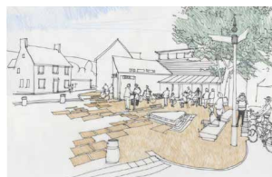
Enhancement of existing and creation of new public spaces within settlements, respecting historic character and sense of place