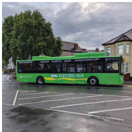
Promoting sustainable and reliable methods of public and private transport to connect rural and semi-rural local communities with the wider region

Key themes have been identified through community consultation and implementation of the Development Framework for the Hagshaw Energy Cluster. They are as follows, and can be most successfully addressed through joint working and strategic planning, as proposed through DVAG: