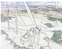
Opportunities for promotion and educational interpretation of green energy technologies to communities and visitors