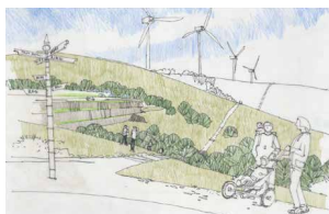
Improved connectivity between communities, through the enhancement of existing and creation of new active travel and public transport links