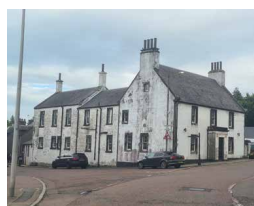
Douglas Arms Hotel proposals have potential to be supported by DVAG, REF, Place Based Investment Fund and Scottish Land Fund