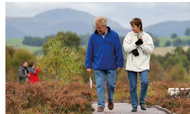
Creating opportunities for recreation and interpretation, with an ethos of access for all abilities, whilst engaging people in nature, biodiversity and the threat of climate change