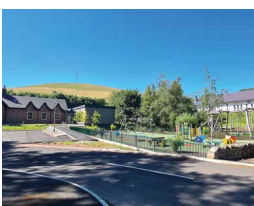
Abington Campus Enterprise has received support from Clyde Windfarm, LEADER, National Lottery Community Fund and REF