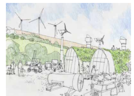
A Renewable Energy Hub, creating sustainable jobs supporting the deployment, servicing and maintenance of renewable technologies in the area