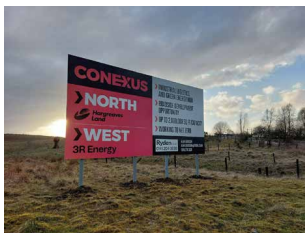
New industrial and logistics development at the Conexus hub adjacent to the M74 brings opportunities to establish a green energy hub and local employment, copyright 3R Energy