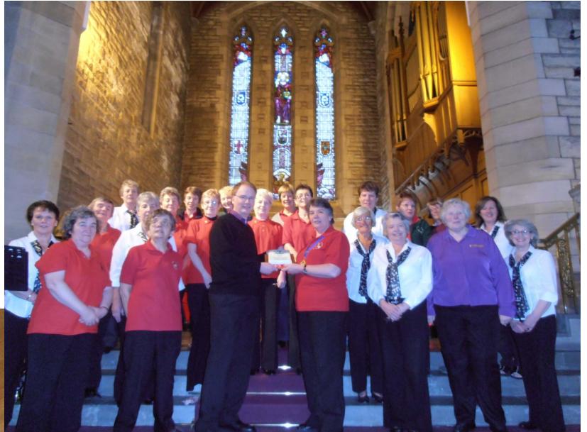
Celebrations at Cathcart