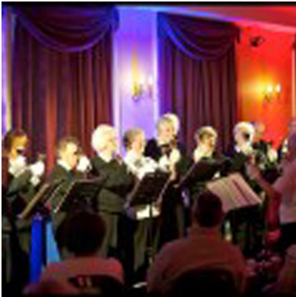
Squeezed into the hall at the Perthshire Amber Festival