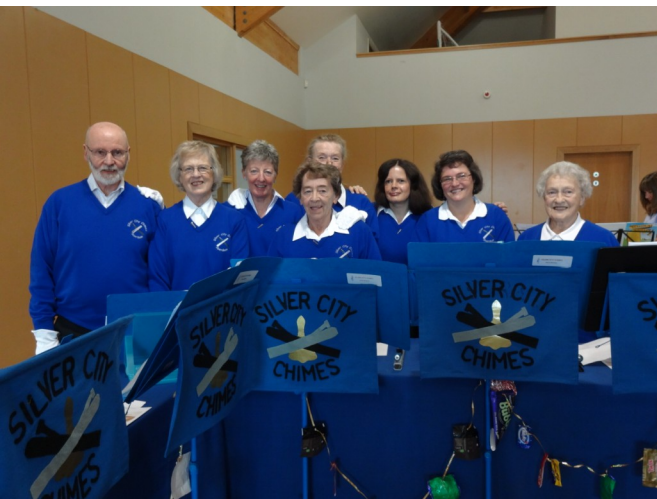
Silver City Chimes

The teams who attended the rally had really used their imaginations in selecting pieces to suit the theme and it was great to listen to such a wide variety of music throughout the