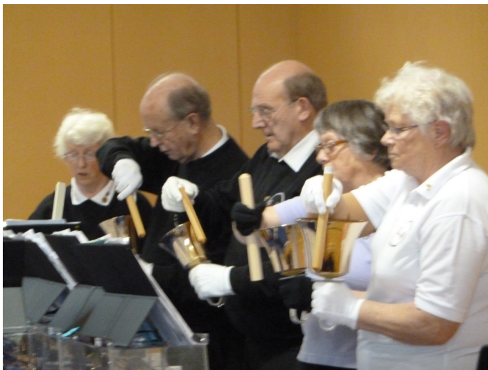
Singing bell technique