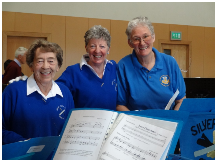
Aberdeen and Gigha join forces