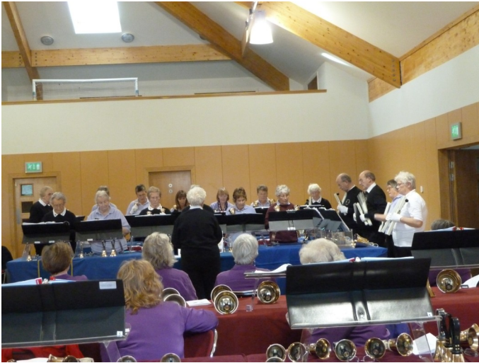
Bells of the Tay