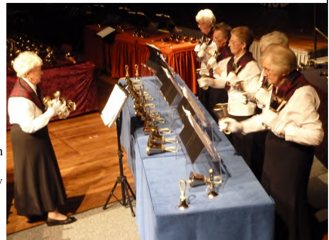
Performing at the Gala Concert in the Evening

our eyes, "Never again compare yourselves to others and think you are not as good. You well deserved your spot in the programme." Many members of the audience told us afterwards how much they had enjoyed our performance with comments such as: a fine mix of different ringing styles from one team, a lovely choice of music, wellpresented, accurate and beautiful, musical ringing. You can imagine how pleased we were to hear such comments! We realise that everyone who makes the effort to come and speak is going to be kind in what they say. We also realise that we were probably invited to ring in only ringers from Scotland attending the rally as a team. Nevertheleader, I am proud that the ringers made that bold decision and carried it through so well.