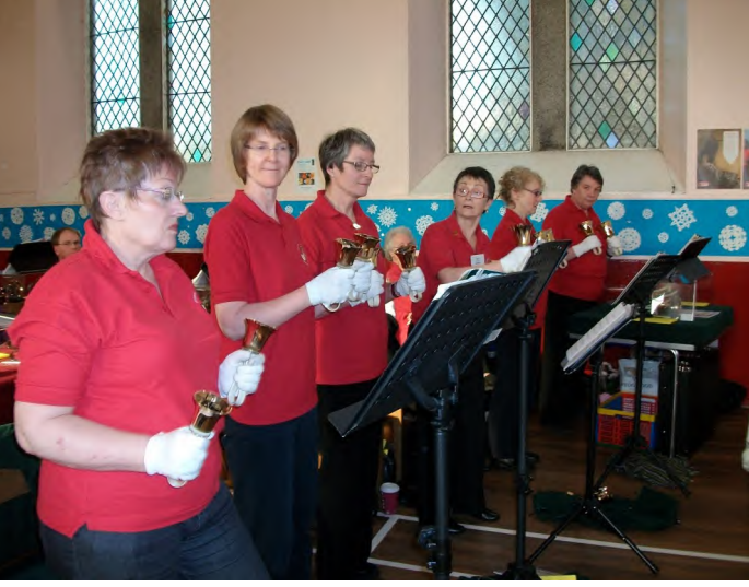
Jordanhill Parish Church Ringers at the Rally

gressed the individual performances were fantastic. The Massed Ringing was really good fun and I loved hearing all the sounds of Handbells, Handchimes and Belleplates to-