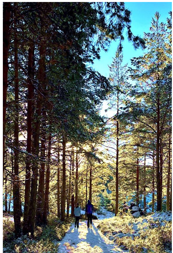
Glen Feshie, 2 nd January 2023

follow us on Twitter and our Facebook page