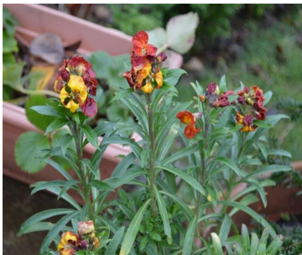
Early colour - Wallflower