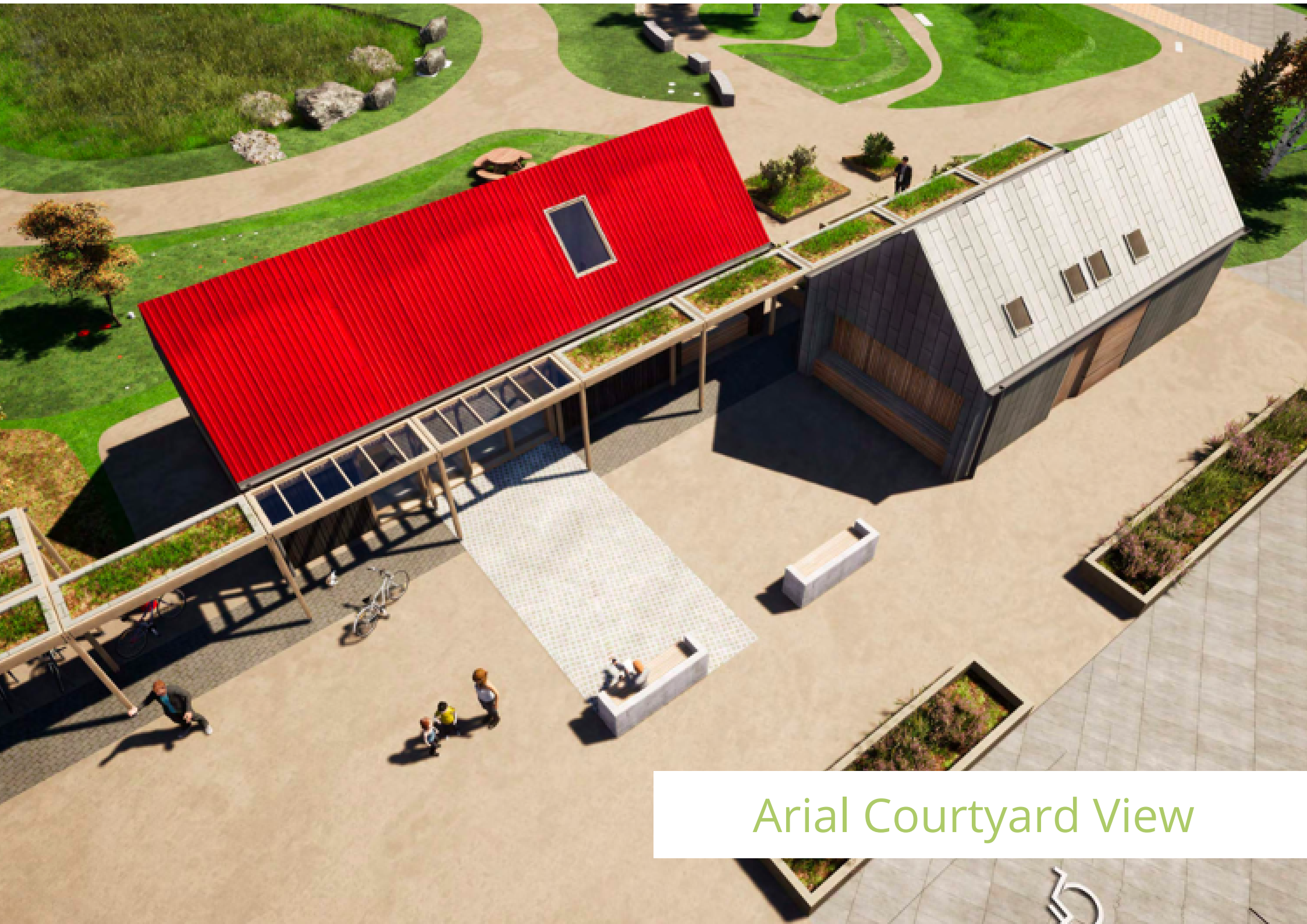
Aerial Courtyard View