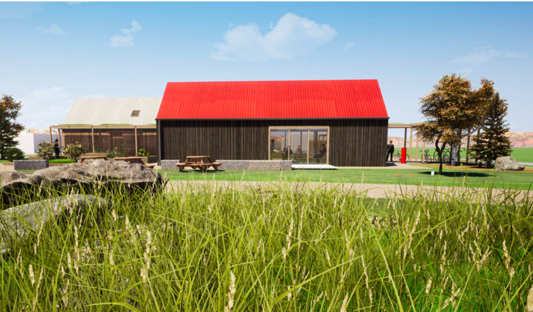
Village Green & Hub Building