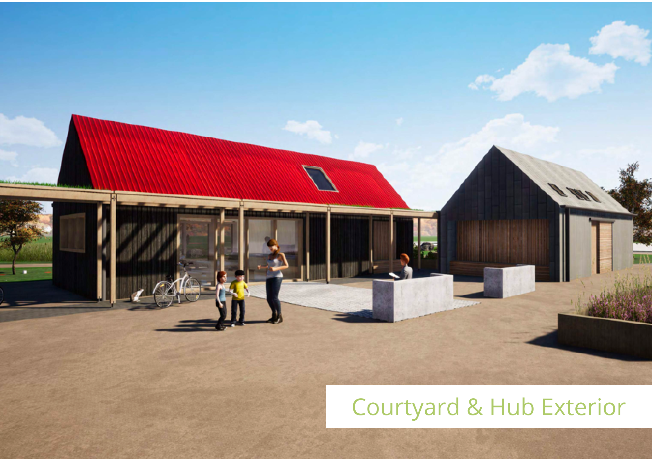
Courtyard & Hub Exterior