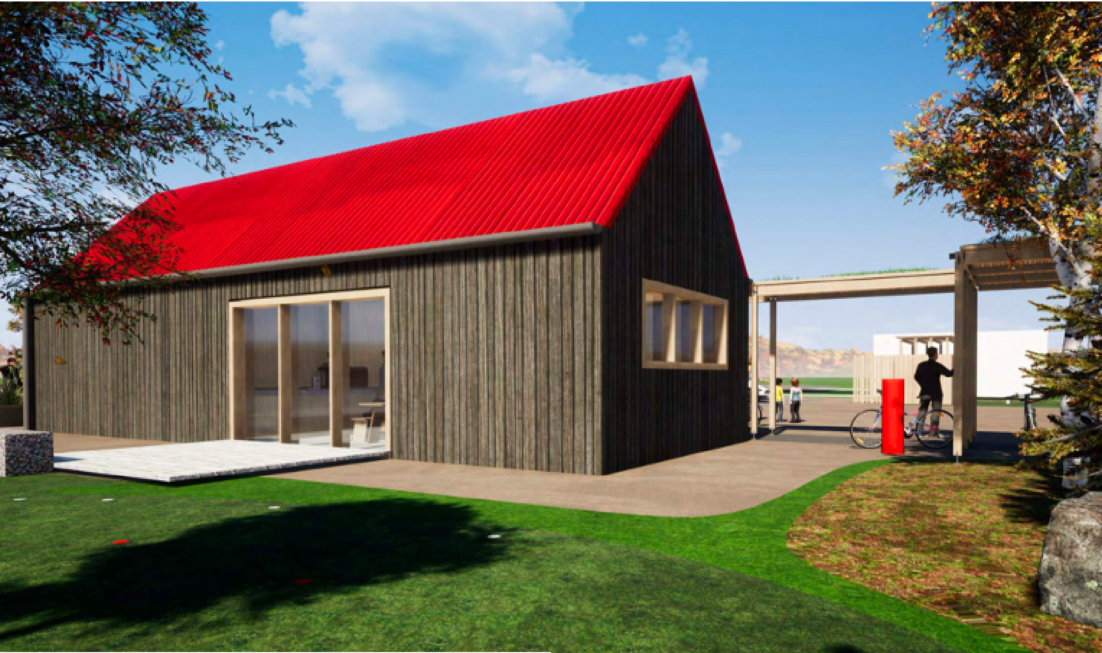
Hub Building Exterior