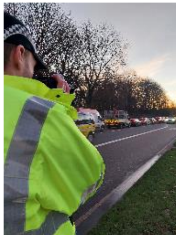
Winter Drink and Drug Driving Initiative