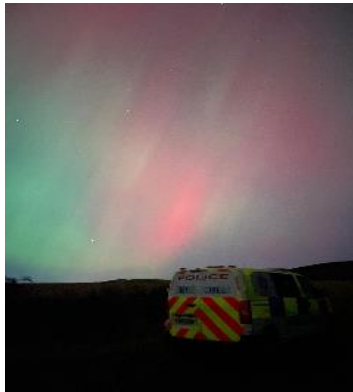
Lucky to spot Northern Lights on patrol