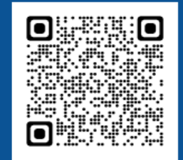
Police Scotland Home Security