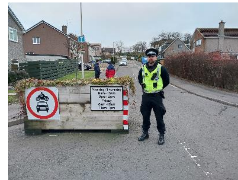
School parking patrols