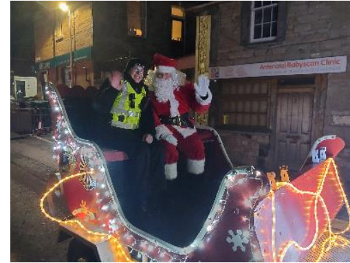
Christmas Lights Switch On Events