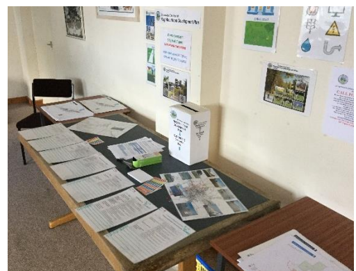
Consultation Display at Village Fete 26 August 2019