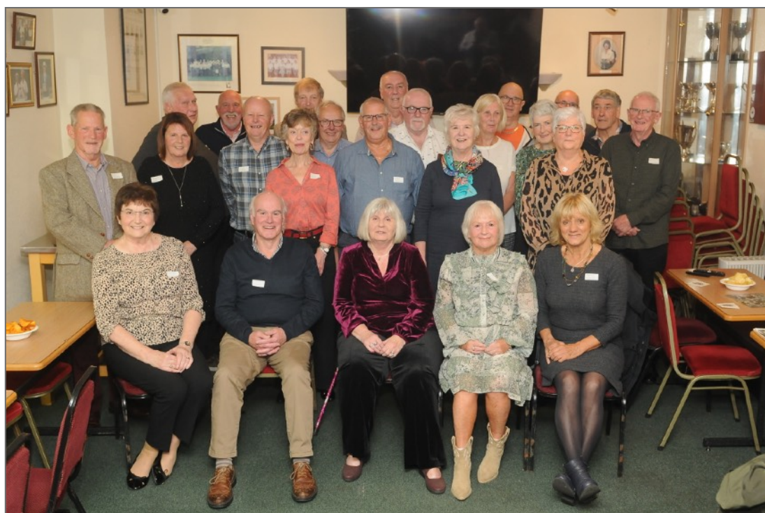
The Selkirk High School Class of 1969 celebrating their reunion at the Ettrick Forest Bowling Club