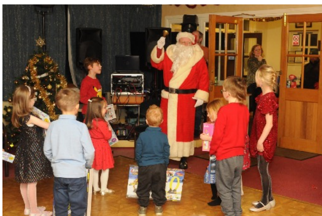
Santa gave youngsters presents before dashing off to his next party