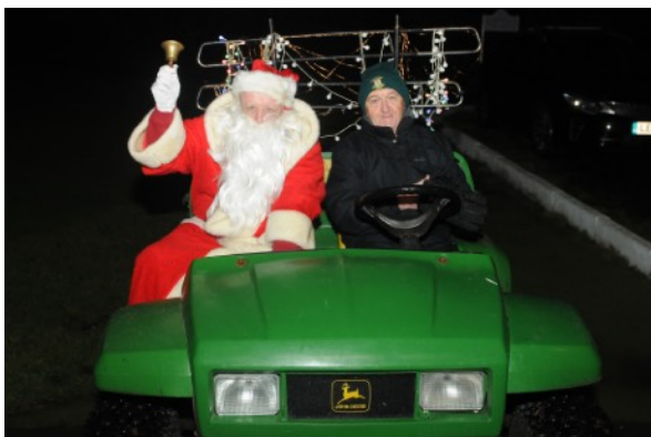
Santa arrives at the Selkirk Golf Club Christmas party