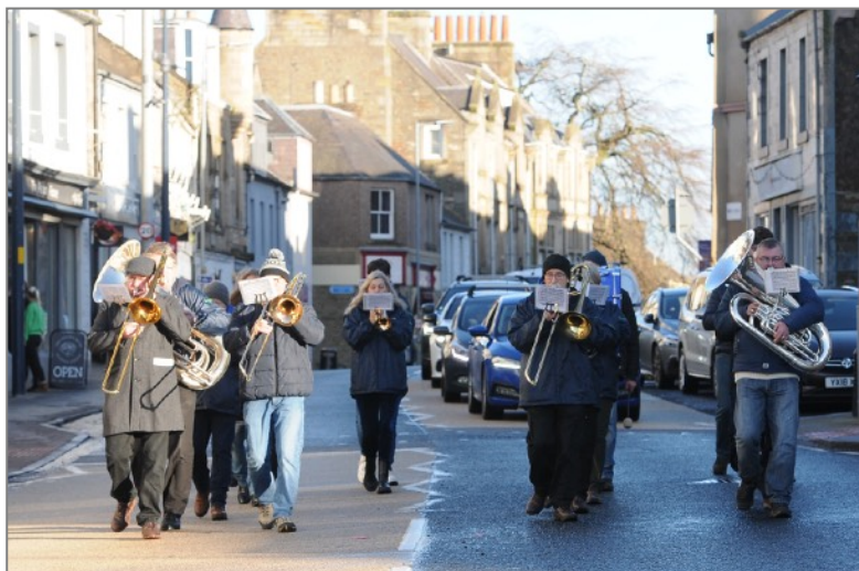
Marching to the Market Place to the strains of Yes Sir, I Can Boogie