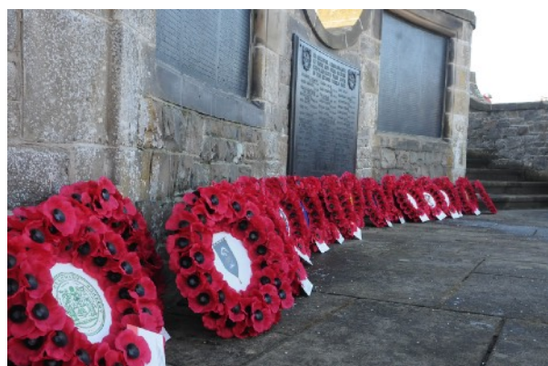
Wreaths laid at the War Memorial