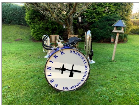
Selkirk News January 2024