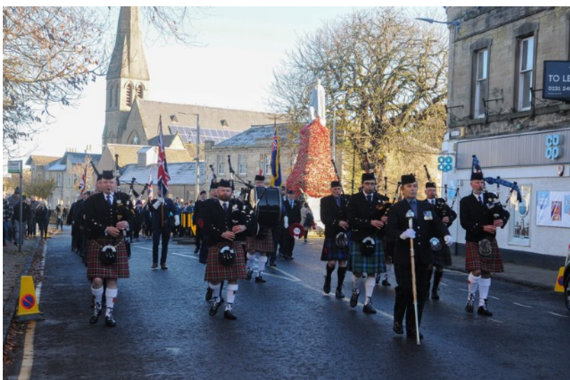
March from the Parish Church to the War Memorial along Selkirk High Street