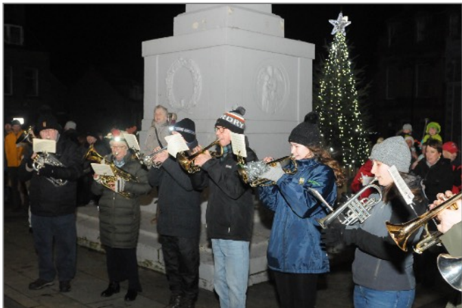
In the Market Place on Christmas Eve