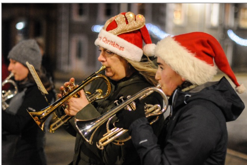
In the Market Place on Christmas eve