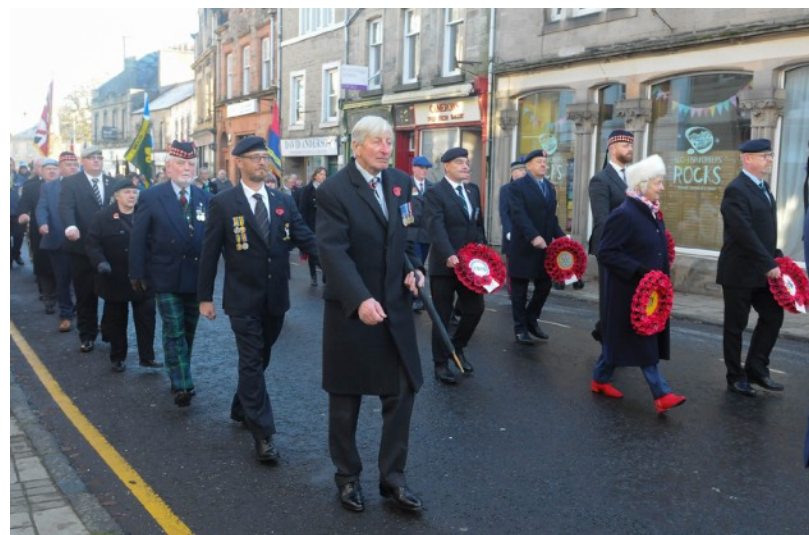
Selkirk News January 2024