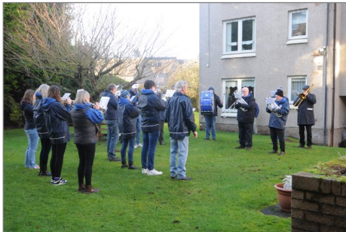
Entertaining the residents of The Bield on New Year's Day