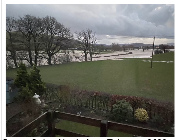
Severn Lake, Aberhafesp. February 2022 after the terrible storms.