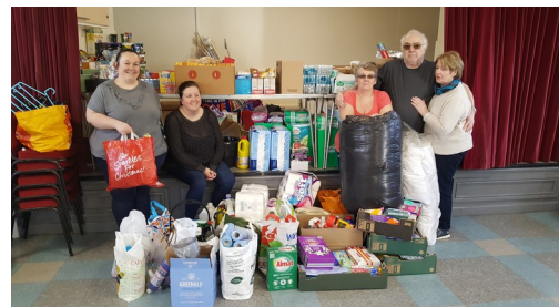
Our donation is on the floor