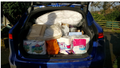
Could not fit any more in!