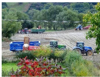
Potato Harvest: In the past 10 years this field has had crops of potatoes for making chips, maize, wheat and now potatoes for Vodka