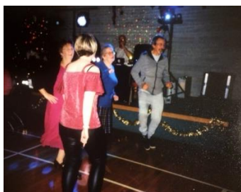
Christmas Spectacular 8 th December Meal & Dancing