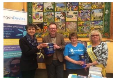
Coffee Morning in Aid of Lingen Davies Cancer Fund