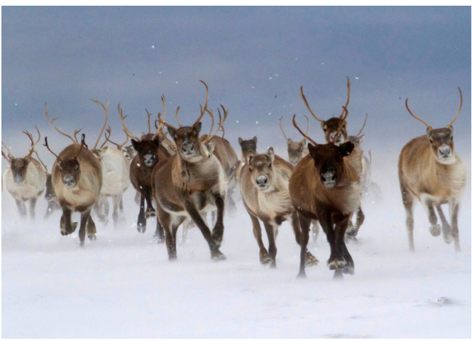
What makes us different?

Reindeer are not a wild species of deer but a domesticated one, and as a result of this they are docile and placid animals. However, they are not a species which thrives in permanent captivity, and as such we have the ONLY herd in the UK who live a semi-wild lifestyle for at least part of each year, roaming completely freely on the mountains in their natural habitat. All other reindeer in the UK are kept in permanent captivity – a situation which can never provide what they truly need.