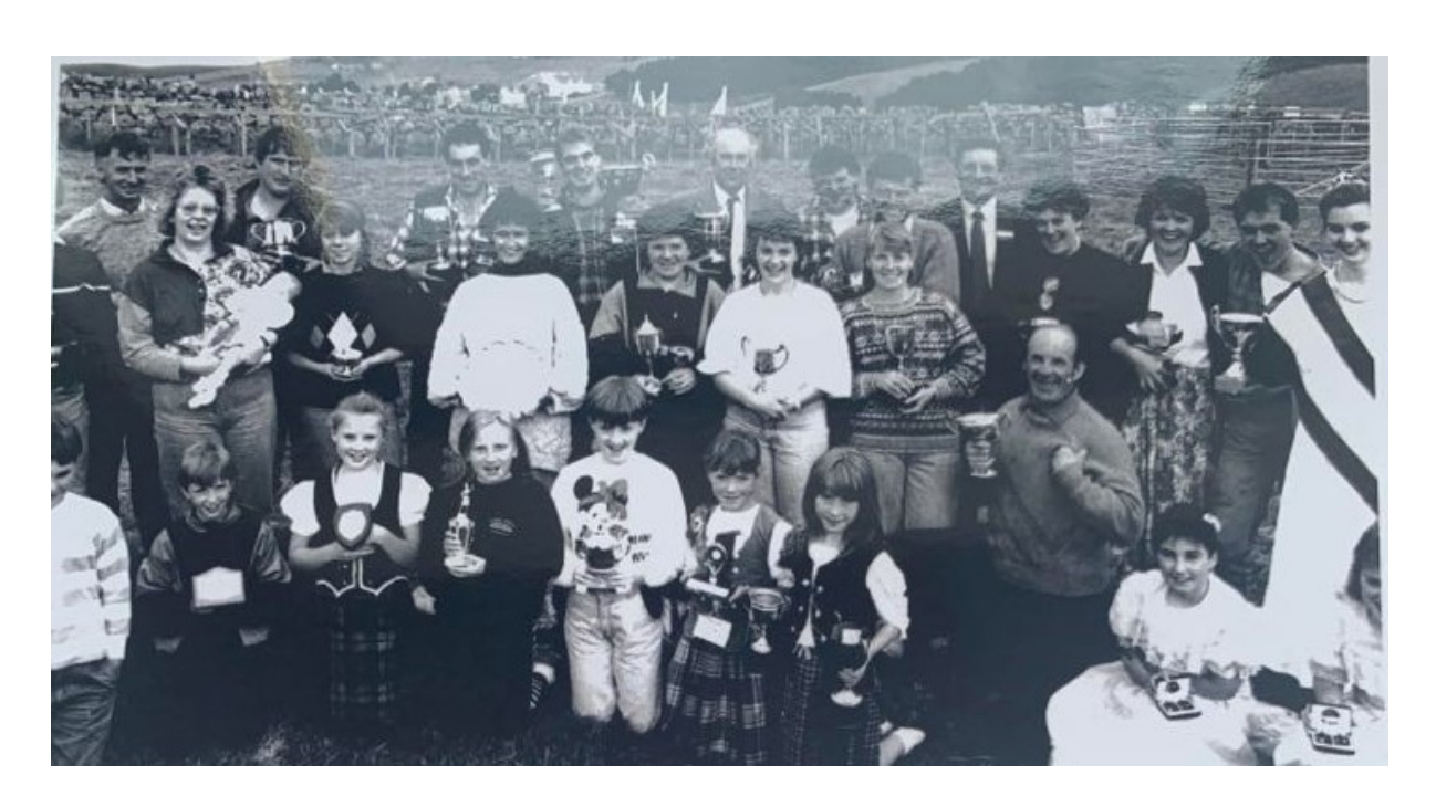
Photograph of Lairg Crofters Show

Names of the faces from Issue 11 of the magazine.