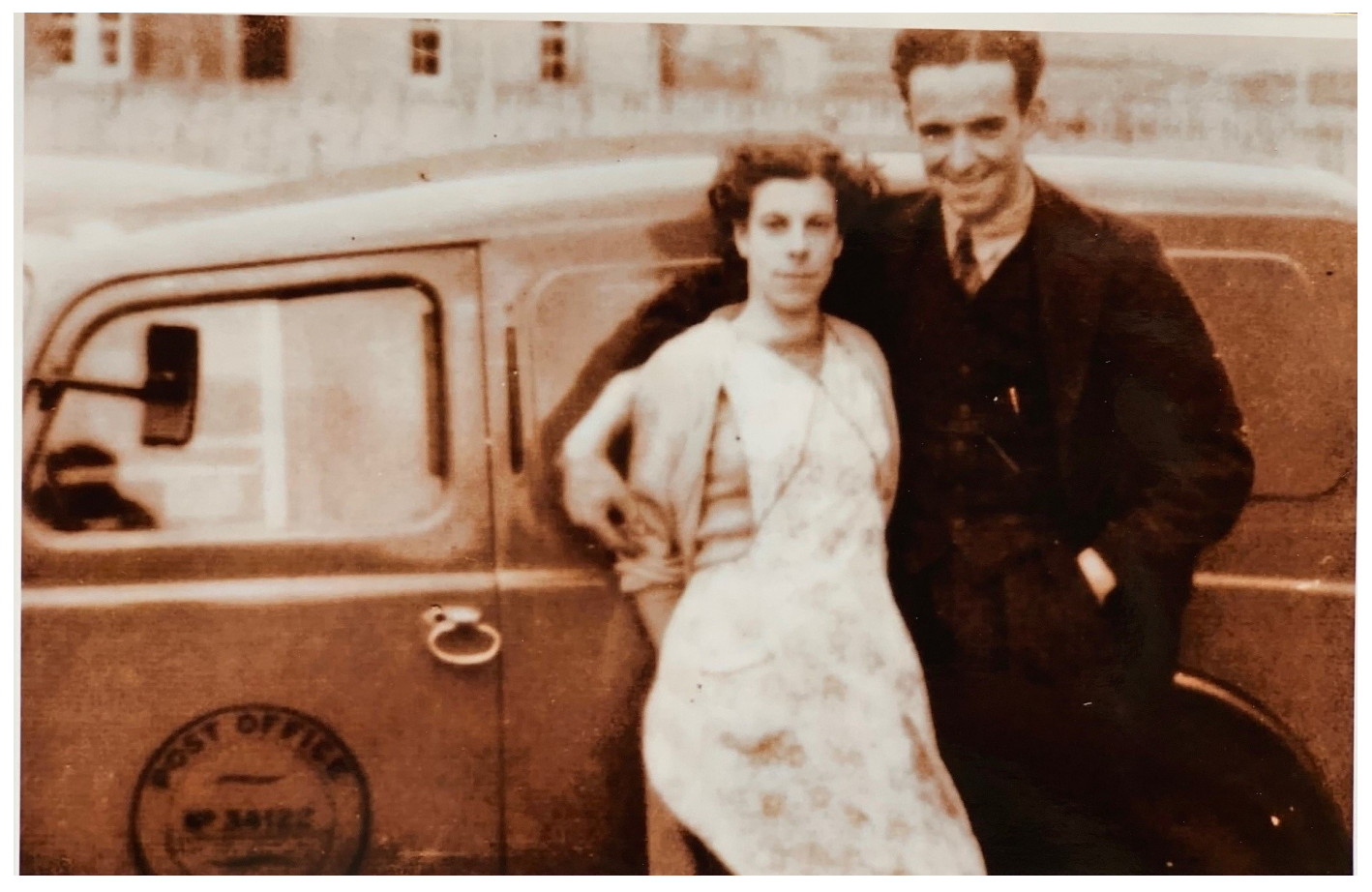
Can anyone tell us anything about this photo?