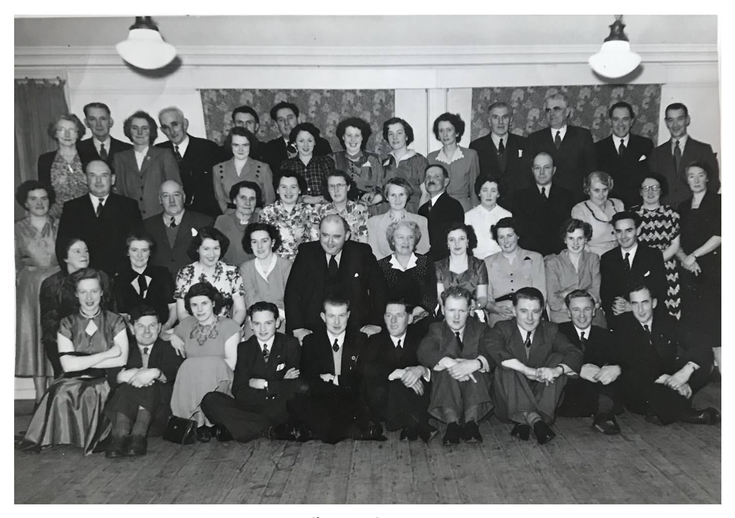
Lairg Post Office Social Evening, 1953