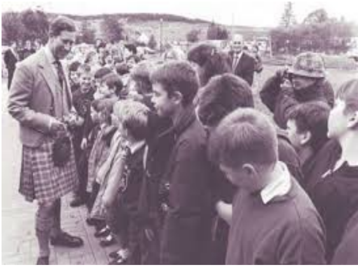
Ferrycroft Centre opening day

THIS PAGE IS DEDICATED TO THE OLD PICTURES AND STORIES YOU WOULD LIKE TO SHARE PLEASE DO, WE CAN KEEP OUR HISTORY ALIVE!!