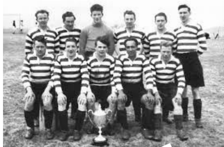
Lairg Rovers football team 1953