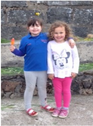
2 happy volunteers after a busy day

Sandwiches and drinks was also provided courtesy of the Board Members of LDCI.