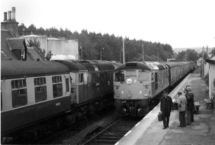
Train station Lairg - any ideas when the photo could be taken?