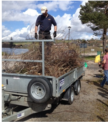
1 of the many fill trailers