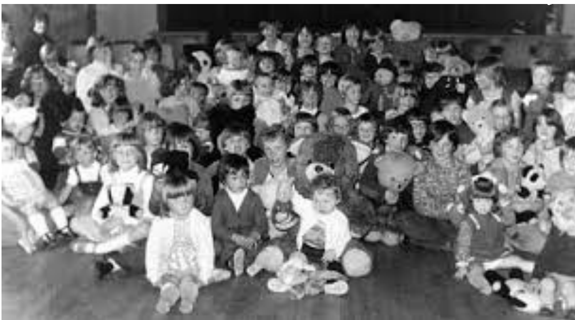
Teddy Bears picnic in Lairg Anybody knows the date or any faces