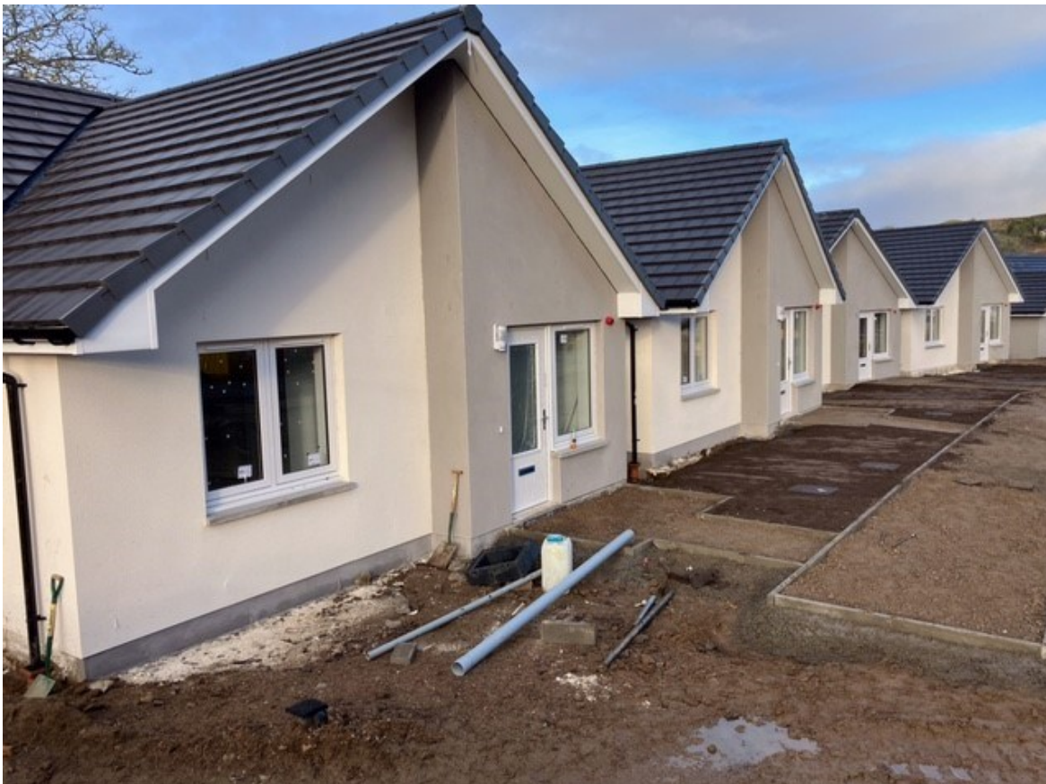
Here's a closer view of units 8, 7, 6 & 5

For allocation of the social houses please ring the same number and ask for the social housing team.