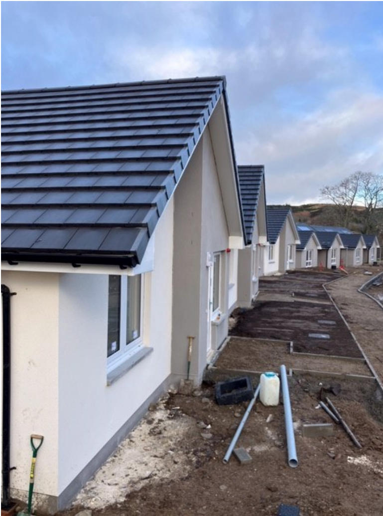
This shows the front of the units looking towards Main Street

The housing project is now in to its 39th week and we can see such a change to the site.