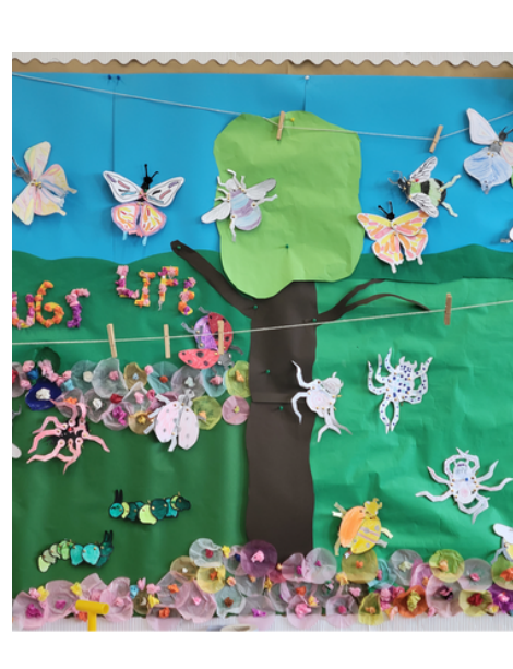
A few pictures from Lairg Primary School