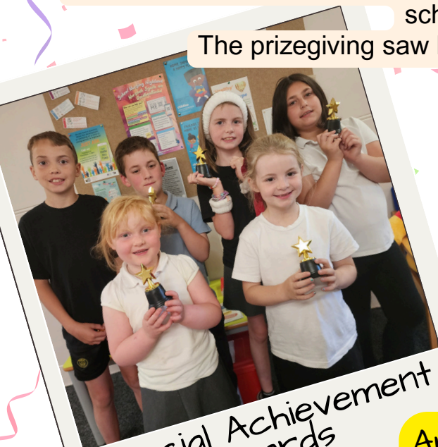
Special Achievement Awards

The prizegiving saw lots of happy faces receiving their awards!