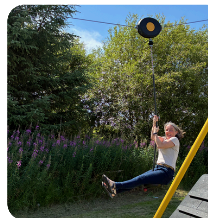
Maree Todd MSP visited the Ferrycroft Park in July to try out the zip wire!