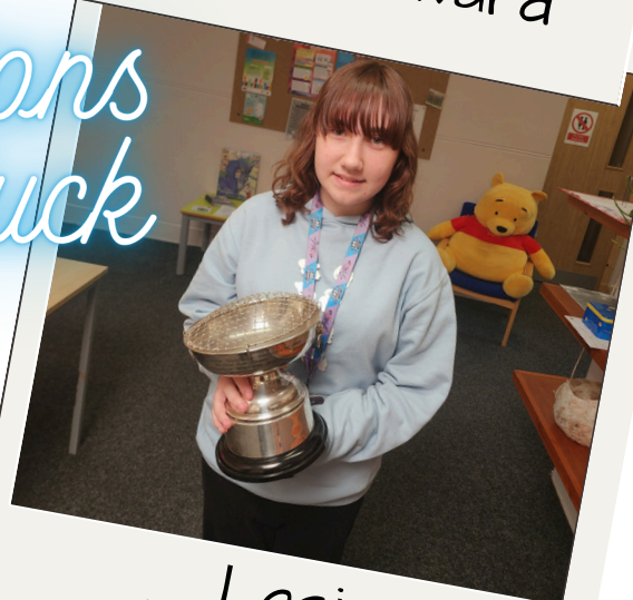
Laci -Art Award

Congratulations and best of luck to all!