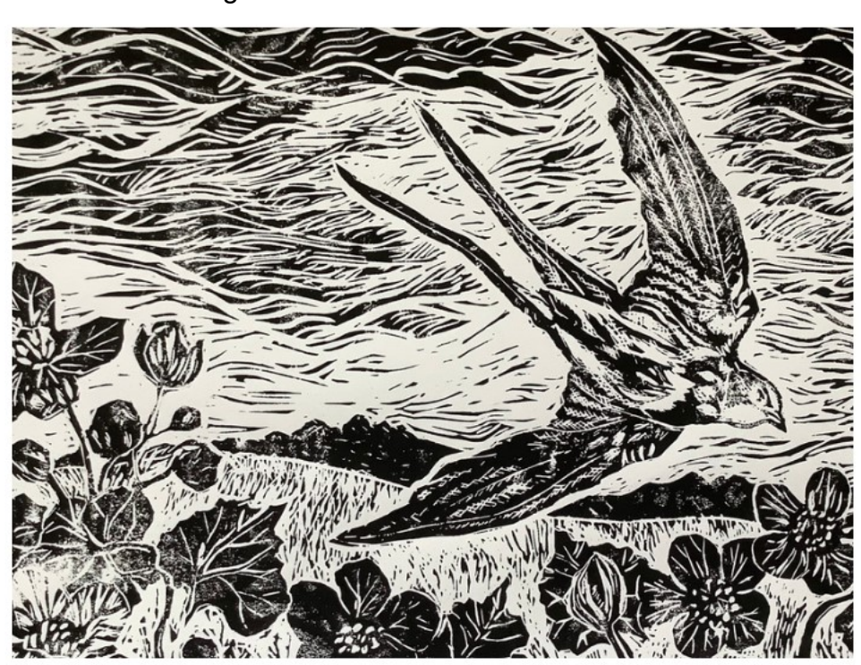
Highland Journal - Artwork of the month