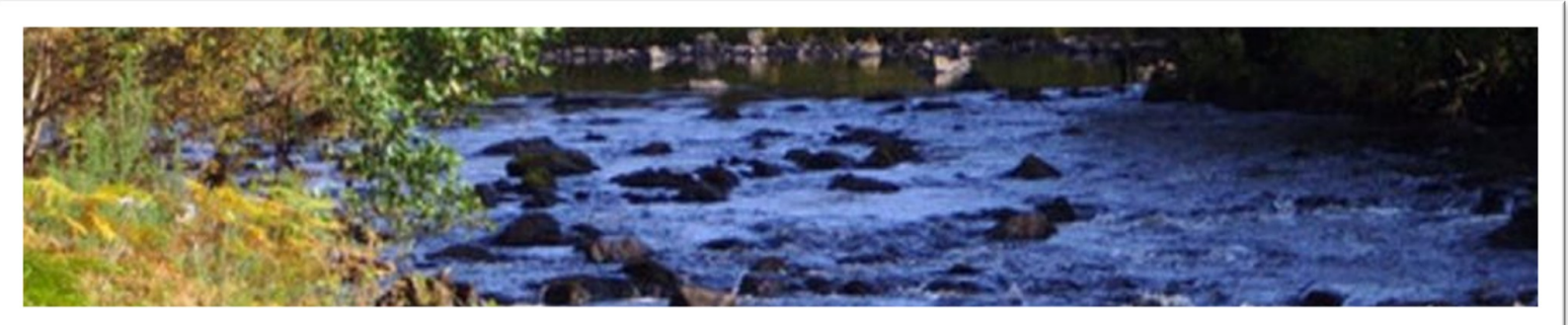
Page 2 - Lairg Helping Hand Fund/Recipe