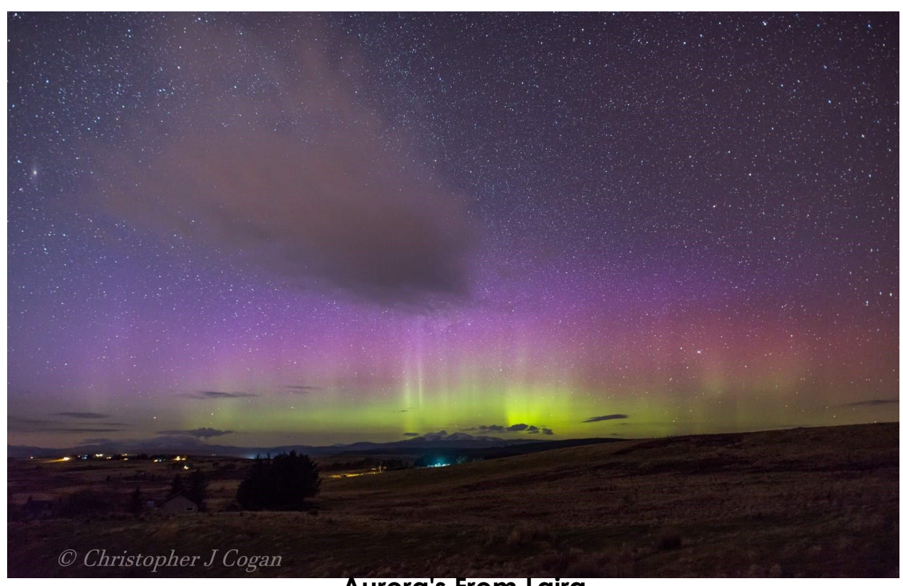
Aurora's From Lairg

The Aurora's are visible from Lairg when we have dark skies, as we have very little light pollution, try avoiding nights when the moon's up, as it takes away the Aurora's brightness. To the human eye they only appear as a brightness to the North, unless it's very active and putting up Rays like in the photo. I thought at first I was seeing a distant logging machines lights, no it was the rays. Mobile phones and digital cameras pick the colours up really well, but you'll need a long exposure to allow the light to come into the device. You must allow time to let your eye's adjust to the darkness for 10 mins. Around Lairg you need to be looking towards Ben Klibreck as that's where the Aurora always as it's due North. There's a very reliable app for letting you know the Aurora is active. aurora-alerts.uk from Skye, free and safe to use.