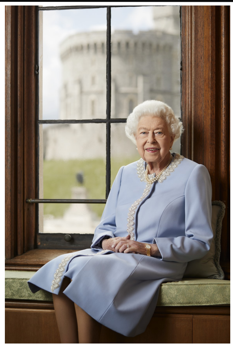
Platinum Jubilee Portait of the Queen by Ranald Mackechnie