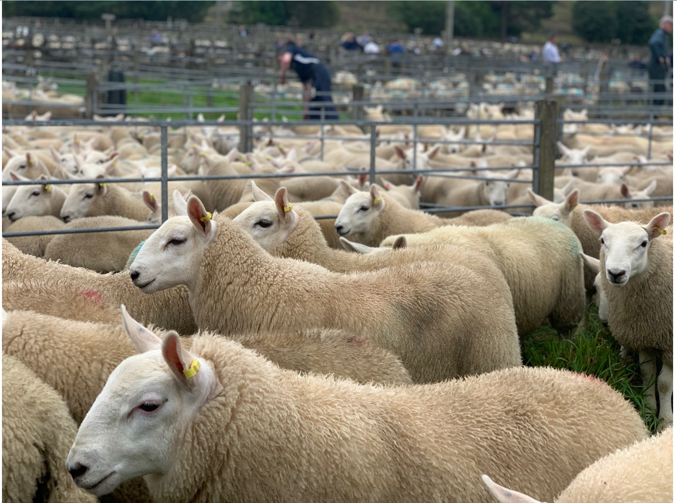
Photo from Lairg Auction Mart on 9th August