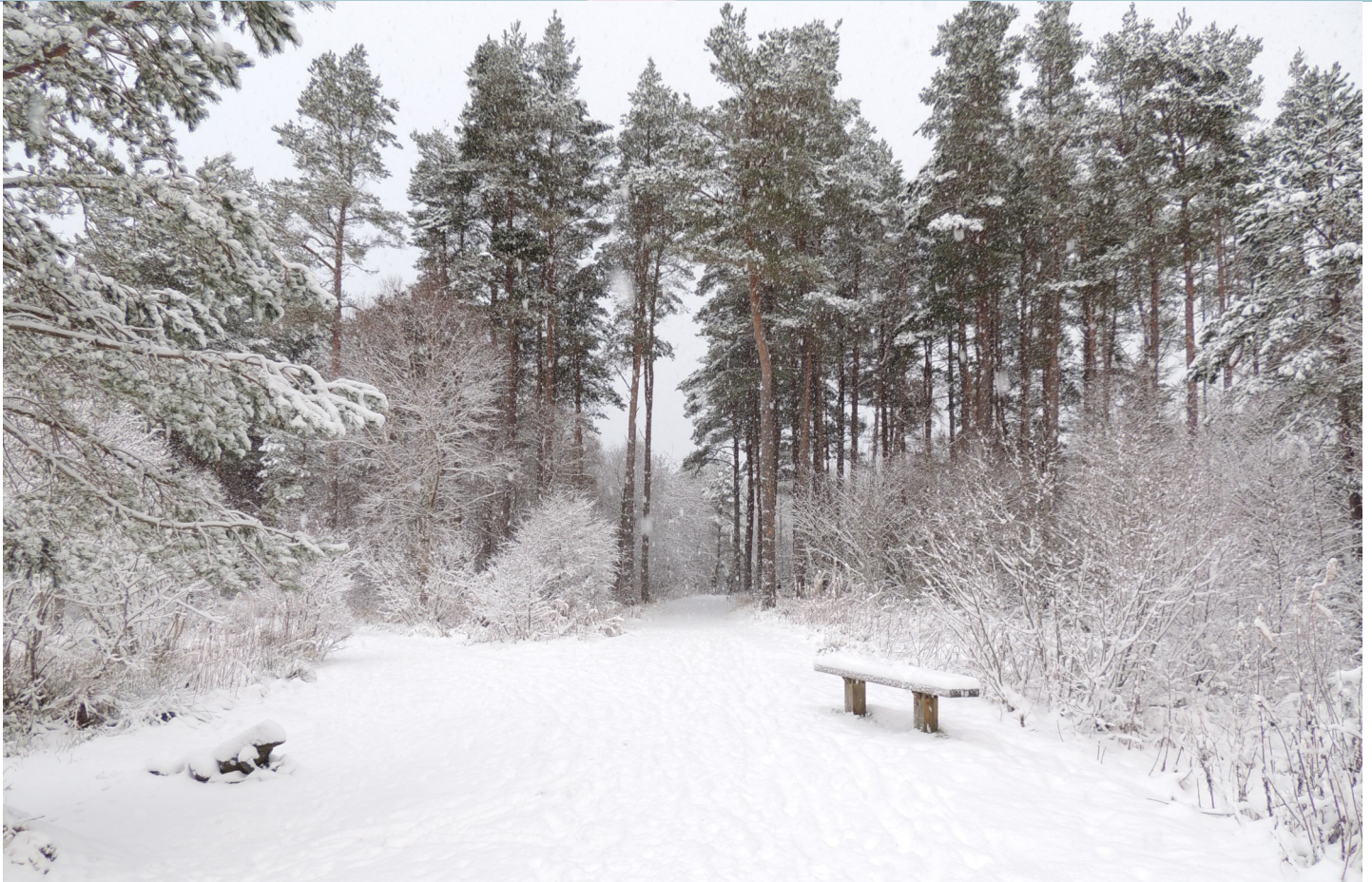
'Winter Wonderland'