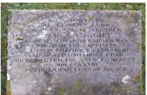
Hugh's epitaph on the tomb, see above

It is also fitting that this is the best surviving example of Miller's skills as a stonemason, especially in ornamental letter-cutting. The grave is at the furthest eastern end of the kirkyard, near the boundary wall.