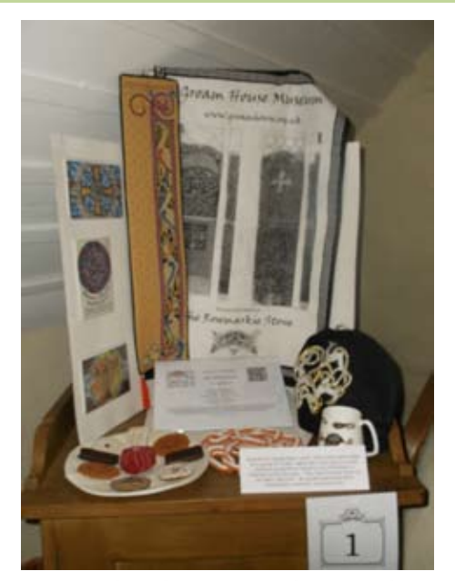
Two excellent displays on Celtic art and its revival were mounted by Groam House Museum.