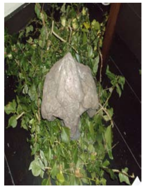
Kirkmichael's fleur-de-lis shaped finial from a gable top, surrounded by the ivy in which it was wrapped. The Kirkmichael Trust hopes to restore the roof.