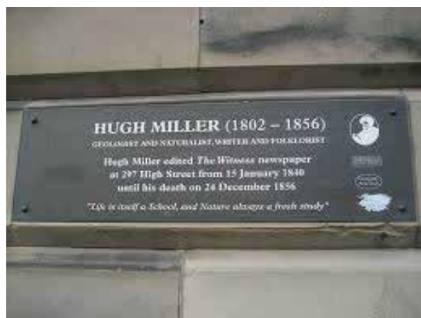
The plaque outside Edinburgh City Council's headquarters, marking the site of The Witness offices