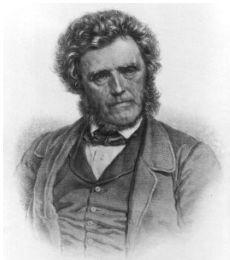
A portrait of Hugh Miller in later life, clearly showing the effects on him of ill health and overwork