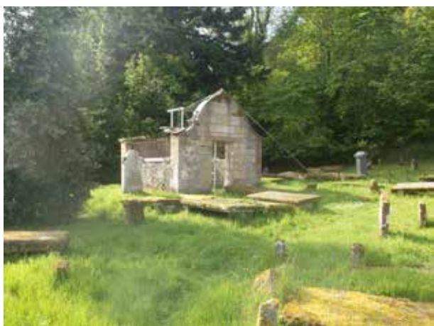
The Forsyth Mausoleum. The scaffolding and a dislodged copestone can be seen on the left of the front wall.