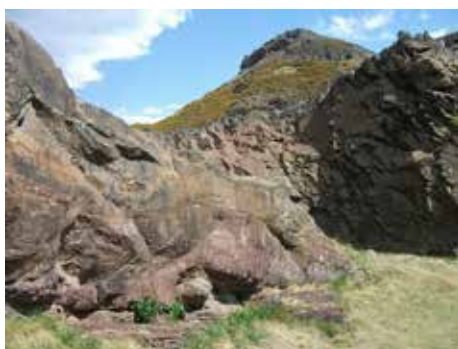
Salisbury Craggs with the summit of Arthur's Seat behind

Hugh Miller on Edinburgh; Edinburgh and its Neighbourhood; Geological and Historical, with the Geology of the Bass Rock, 1875