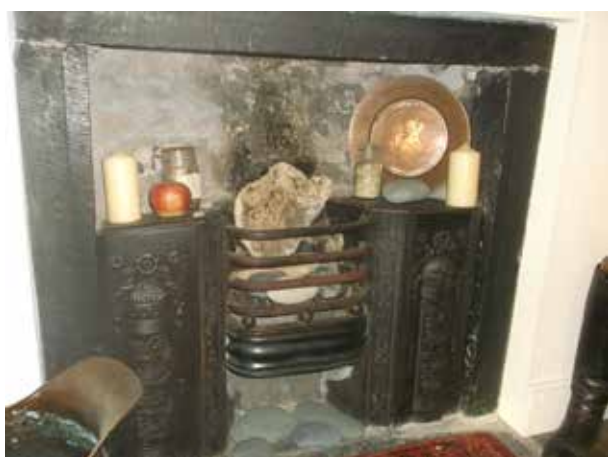
One of the original fireplaces still in use