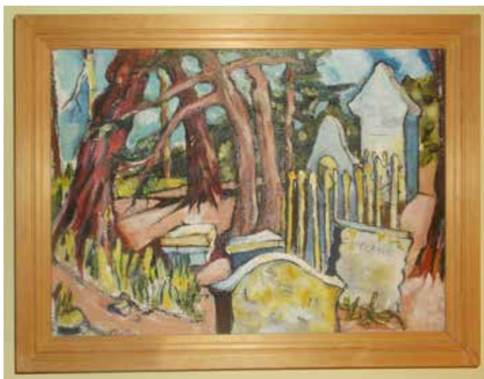
Painting of the Old St Regulus burial ground by Frieda Gostwick