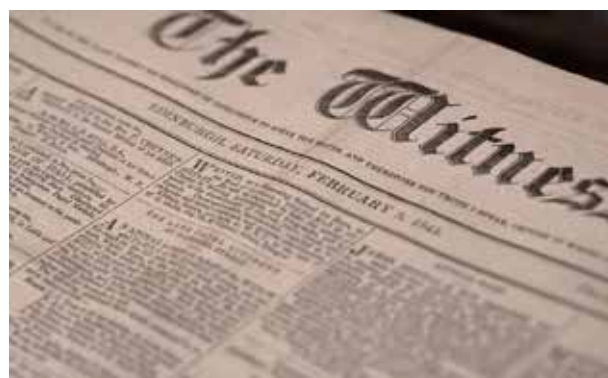
A front page of The Witness