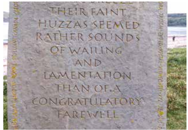
Part of the standing stone on The Links marking the emigration to Canada from Cromarty in the 1830s of thousands of cleared Highlanders. The stone was erected to mark Hugh Miller's Bicentenary in 2002