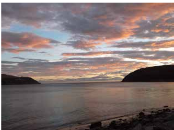
A Cromarty sunset offers exactly the same view today of the Firth and the Sutor headlands as Hugh and his young friend would have revelled in