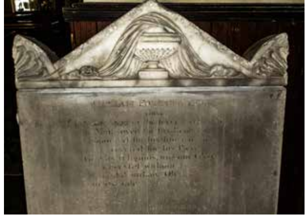
The top of the headstone preserved in the kirk's east porch