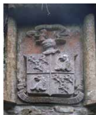
Clan Urquhart crest

This is our first appeal in a decade. It is addressed particularly to our members, as well as to all those who know about and admire Hugh Miller.