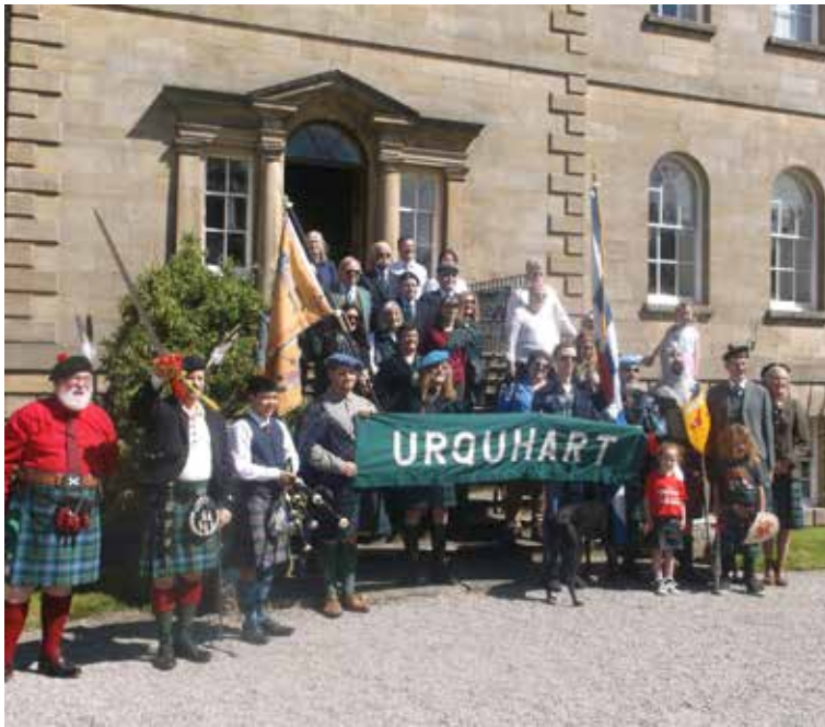
Above: Clan Urquhart at Cromarty House Right: A clan group at Cromarty House Below: Urquhart crest in Cromarty House