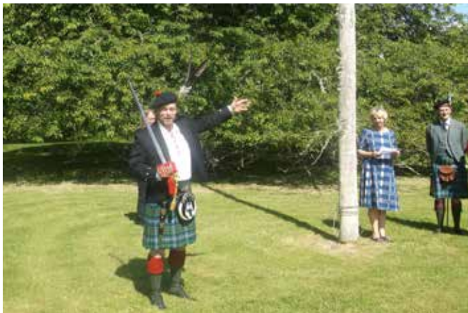
Urquhart clan chief