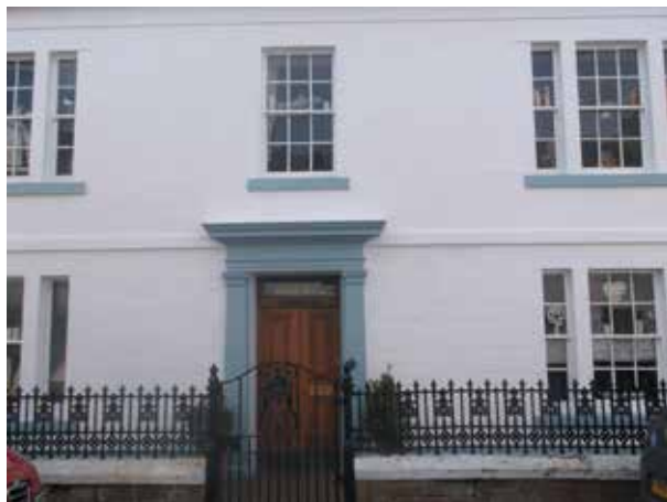
The front of the Ross family home, which also served as the office of the former Commercial Bank Front door