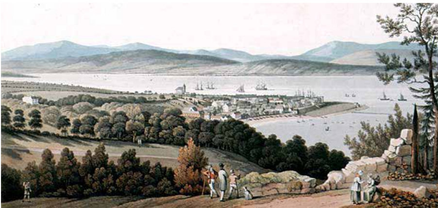
An engraving of Cromarty seen from the South Sutor taken in 1825