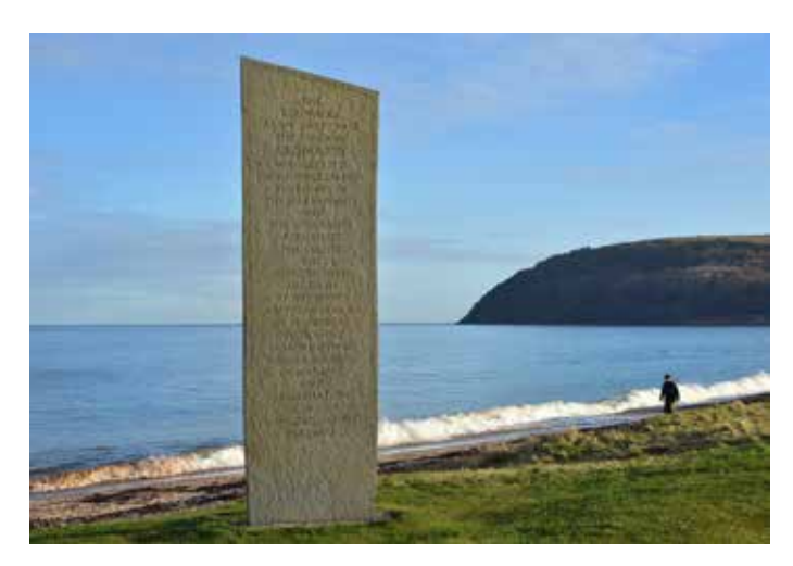
Emigration Stone.