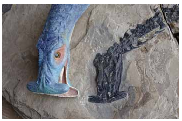
Atopodentatus unicus has been described as a "hammerhead herbivore," a plant-eating marine reptile located in Yunnan, SW China, dated around 244mya, and said to be between 2.5 and 3 metres in length.

bers, who do not need to book, are: zoom.us/j/5523459723. Meeting ID 552 345 9723, password Trewin. Covid restrictions have made it impossible to use the NMS auditorium as originally planned. While the lack of a physical meeting is undoubtedly a loss, the organisers are confident it will prove very popular in this "new normal" Zoom format, and it is hoped attendance will be in three figures.