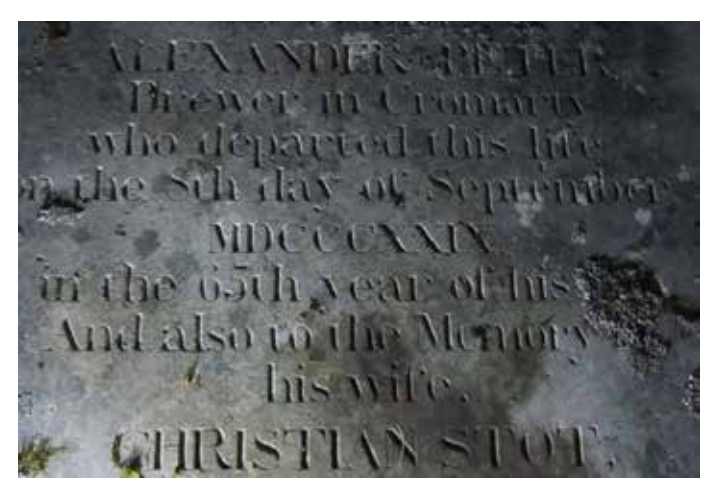
Brewer Alexander Peter's inscription.

Miller's use of thin and thick carved lines have been compared with the light and heavy strokes downward