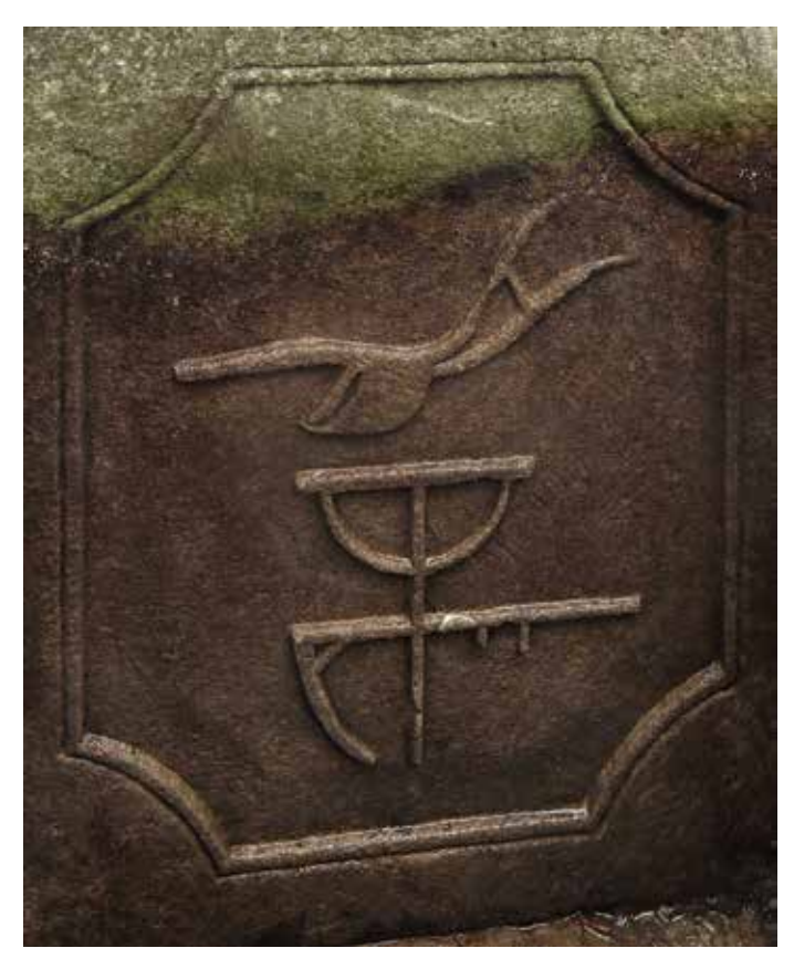
The tomb's farming symbols.