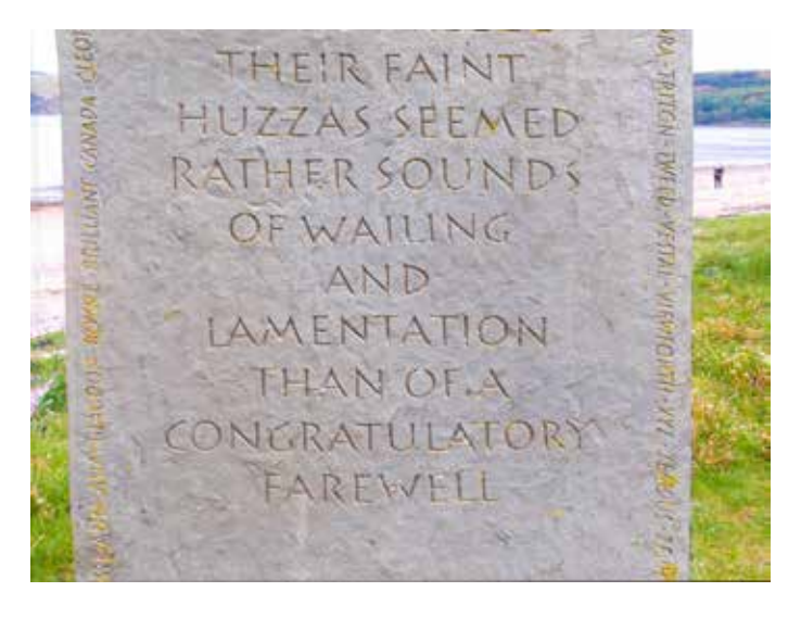
Cleopatra farewell script.