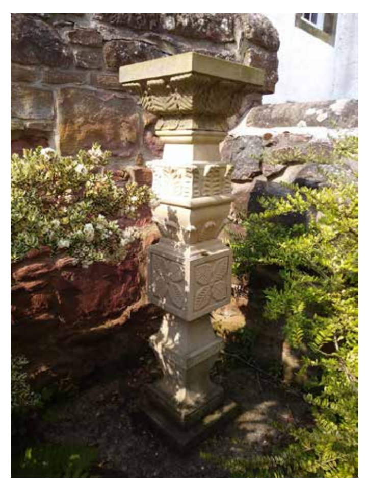
Pedestal replica.