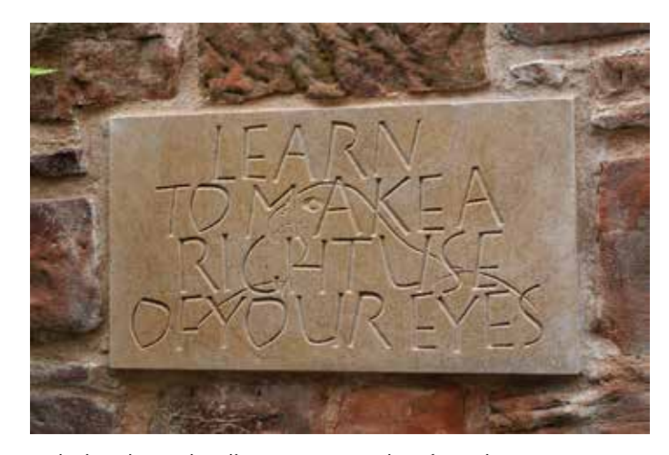
Plinth in the Hugh Miller Museum's Garden of Wonders.