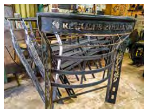
The section shown is due to be sited at the lower, roadside end.