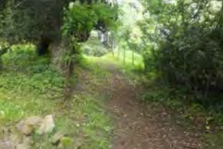
The path as it is now

Our management committee has enthusiastically welcomed the progress so far. Comments have ranged from "lovely design," to "such a worthwhile project," and "it's really exciting it's actually going to happen at last." We anticipate holding an informal ceremony for donors and representatives of the Cromarty community. Provisional date, Sunday, September 12th, 2.00pm. Numbers will have to be limited, not only because of COVID but the relatively small spaces involved. Invitees will be notified by email.