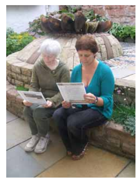
Visitors enjoy soaking up the information about the "Garden of Wonders" in Miller's Yard

If you have a couple of hours to spare and are looking for a challenging task and an enjoyable time there are always plenty of things to be done at the property, from sweeping and tidying the gardens; to cataloguing and collection care. Why don't you join us? For details, give me a ring on 0844-493-2158 or email millermuseum@nts.org.uk .