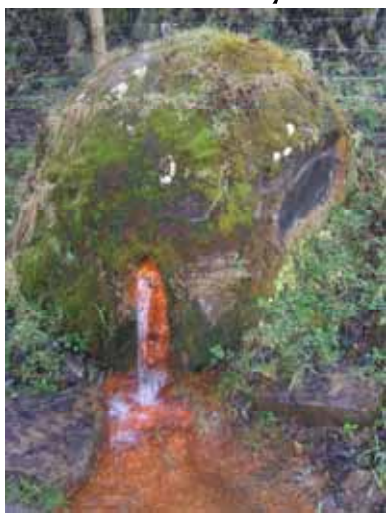
The well waters are 'enveloped by a ferruginous coagulum'

The wellhead is a mossy masonry dome about chest-high to an adult, with an outlet on one side: plainly there is enough pressure to produce a head of at least a metre or so above ground, giving 'one of the finest specimens of a true Artesian well which I have anywhere seen' (Miller 1841, p. 181).