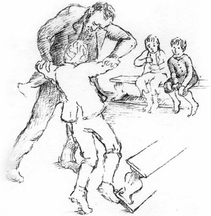
A horrible brawl