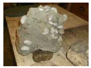
See Isle of Skye's Dinos and Mammals Handle Fossil Collections Go Beachcombing for Fossils Discover Ores and Minerals