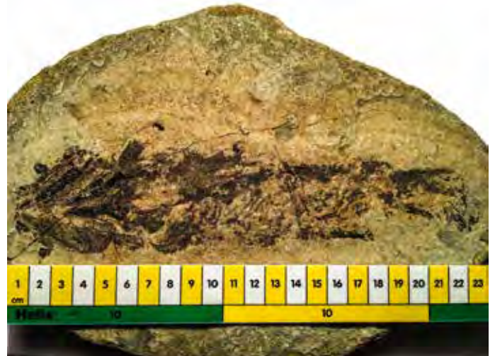
Top: Cromarty pebble beach Middle: Cheirolepis Below right: Cheirolepis Fin detail Below left: Cromarty Fossil Fish - Cocosteus Jaw, All © Sidney Johnston, 2023