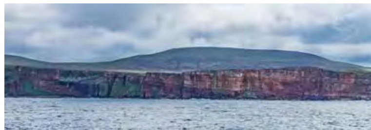
Cliffs of Hoy