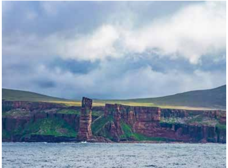
Old Man of Hoy.