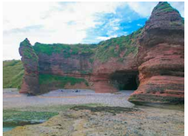
Top to bottom: The Needle's E'e ; The Deil's Head; The Three Sisters; The Mason's Cave