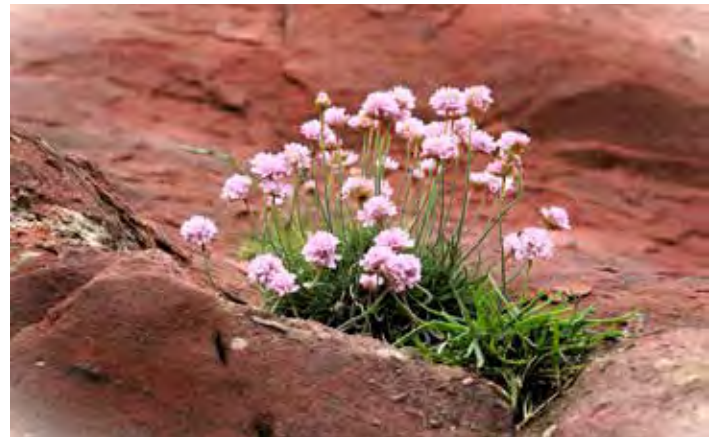
Sea pinks on sandstone.