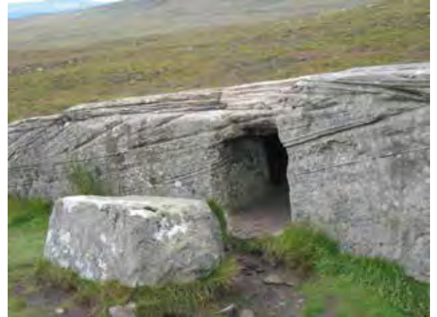
The Dwarfie stane.

Miller was made an honorary member of the Society and one of the Museum's prize exhibits is Homosteus Milleri , named after its collector, and according to the Museum's website 'a flat, heavily armoured placoderm fossil ... found within the Old Red Sandstone sediments of the Sandwick Fish Bed'. It was the discovery of this fossil which led Miller to write his book The Footprints of the Creator, Or, the Asterolepis of Stromness .