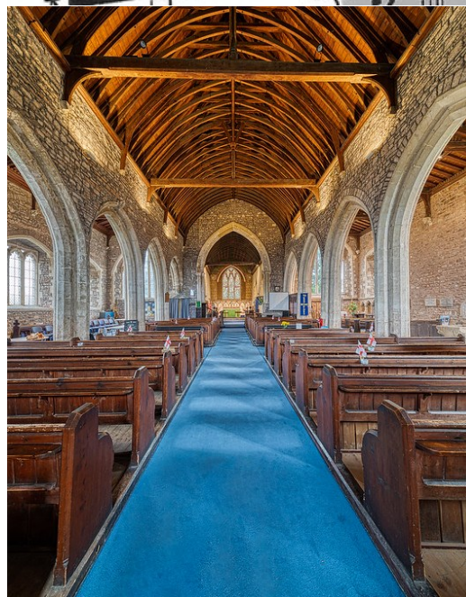
The interior of St Mary's Church