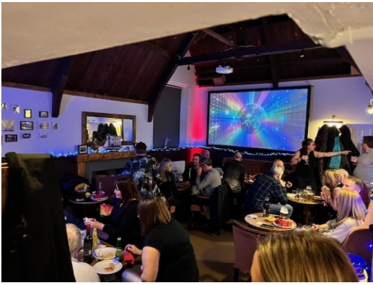
Above: New Year