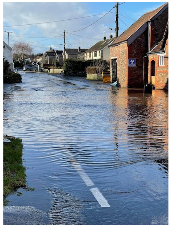
Flooding outside the Village Hall