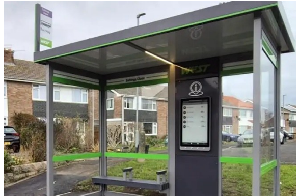
Above: new style shelters now in place Below: work underway on the Sheepway

Bristol Airport: A new Transport Interchange has been completed. More details are in this video ( click here ) – there are now more bus spaces and improved bus links to the airport. Passenger drop off costs £7 for 10 mins access (£7 for 40 minutes for blue badge holders) at the interchange but free drop-off is also available in the “Waiting Zone” on the way to the Car Rental area – this is served by a frequent bus service to take passengers to and from the terminal.