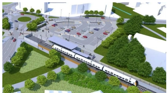
Above: new Portishead station plan Below: design for the new station entrance