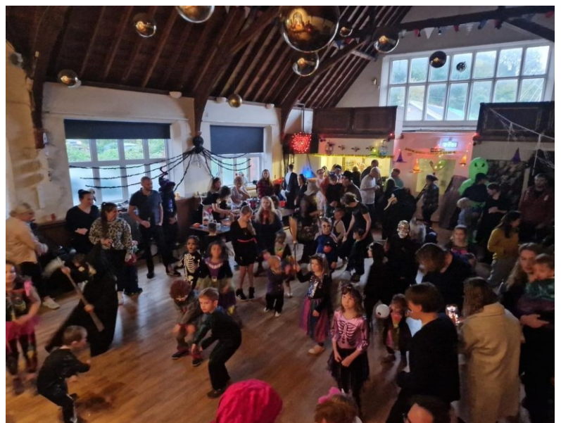
Halloween Children's Party in the main hall

Hire the Hall, Club room or whole facility for your next event: www.portburyvh.org.uk or email PortburyVillageHallBookings@gmail.com