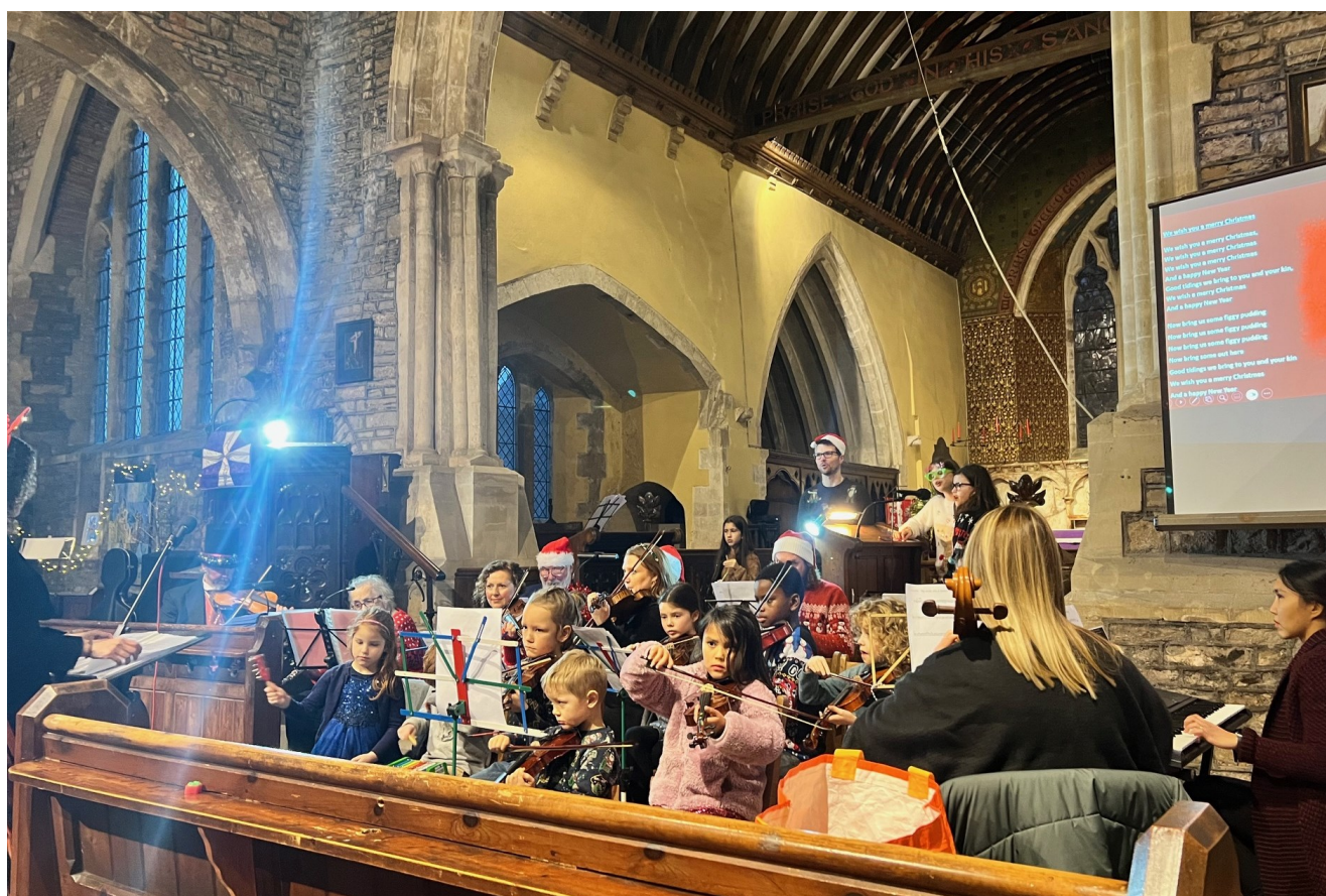
Performers from Heartbeats at the recent Christmas Concert