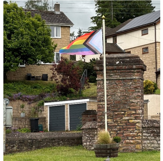
Pride flag flying for Pride Month in June

Following the successful pilot of offering a recycling box for empty medical blister packs (which are not able to be recycled using other routes), the Parish Council will continue to fund this in 2026-2027. This box is available at the Village Hall. Please check there are no tablets left in the packets! If the box is full, please leave packets neatly in carrier bags and they will be added to a subsequent box when available.