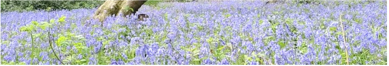
Bluebells in full bloom in Prior's Wood

Portbury Parish Newsletter – Summer 2026