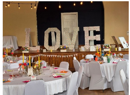
The hall dressed for a recent wedding

Membership is only £10 for individuals, £5 for Seniors and £20 for a household and also includes 10% off purchases at the bar and hall hire too! As a volunteer organisation, we are always looking for new recruits – come and ask how you can get involved!