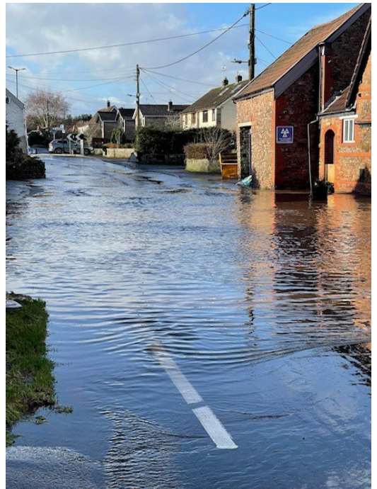
Flooding outside the Village Hall (in 2024)