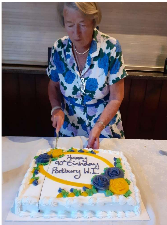
Cutting the cake at our 90 th Anniversary