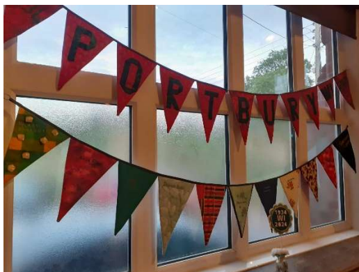
Portbury WI's new bunting on display

In October we will have our Annual Meeting where we will be looking back on another enjoyable year and in November we will be making Christmas decorations for our entry in Portbury Church's Christmas Tree parade – and maybe some extras to put up at home too.