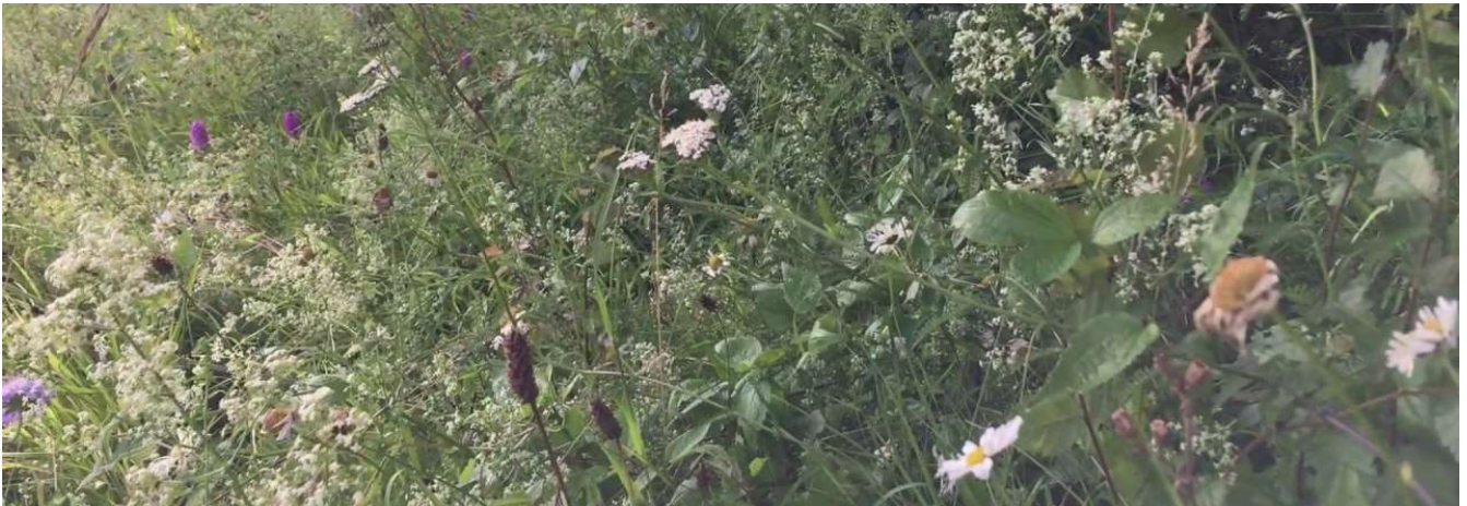
Wildflowers thriving on St George's Flower Bank – alongside the Martcombe Road

Welcome to the summer edition of the Portbury Parish newsletter. We hope you are finding these useful and interesting. Anyone who would like to add news, stories or anything else that you feel would be of interest to the residents of Portbury, please let me know. We regularly approach local organisations and businesses to contribute. If you would like to add to the next edition, please email crisc@portburyPC.org.uk .