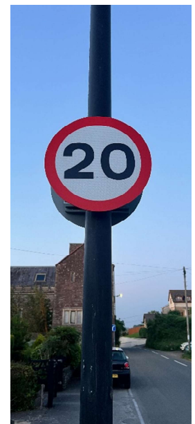
New 20mph repeater signs in the village.