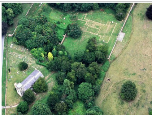
■ The ghostly outline of Londesborough Hall, near Pocklington, East Yorkshire, a magnificent "lost" stately home demolished in the 19th century (Image: Peter Hallon/PA Wire)

Photo sent in by Peter Bernard from the Wolds Wanderers, who recently visited the site.