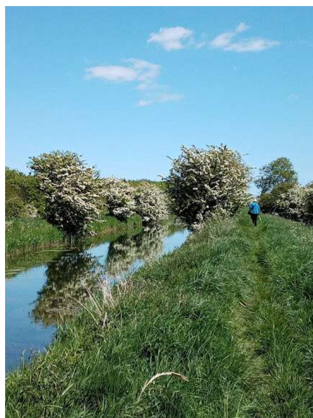
Scurf Dyke, beyond Emmotland