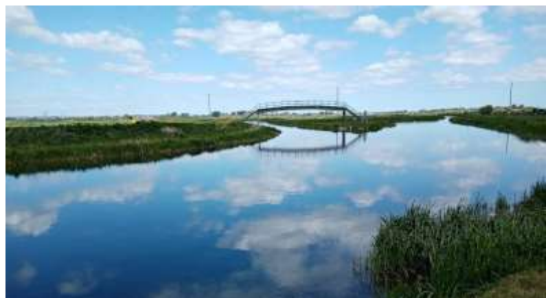
"The Bridge to Nowhere"

Suspended for the foreseeable future, as is the PTFA. Stay well, stay safe and we hope to see you soon!