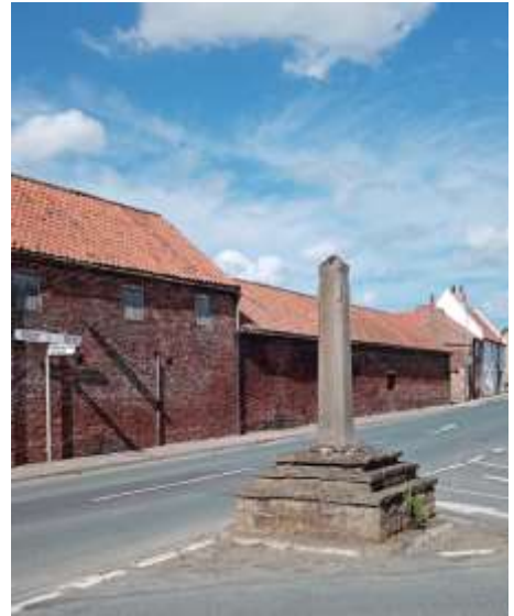
Village assets and features, kept in good order by dedicated helpers