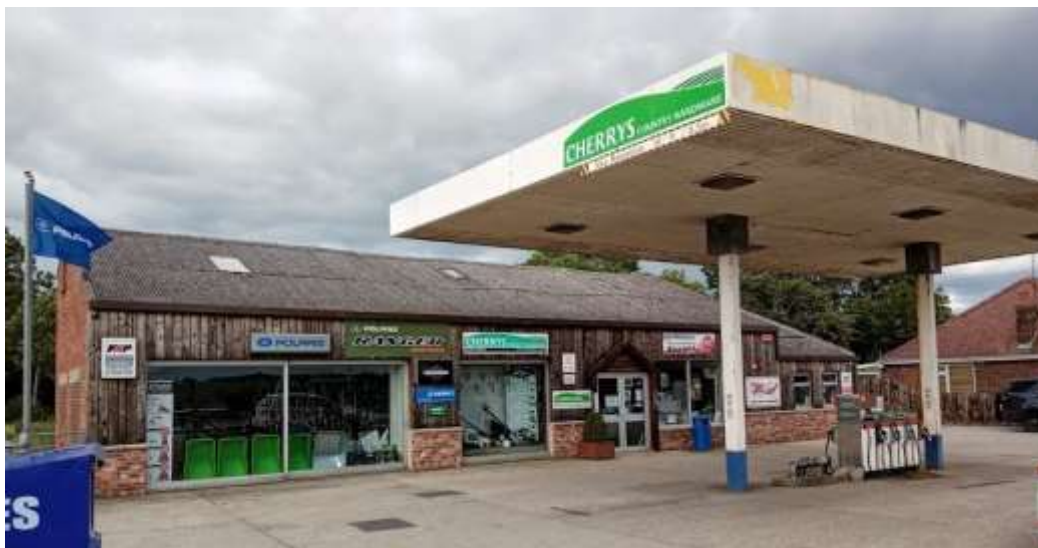
Village assets and features