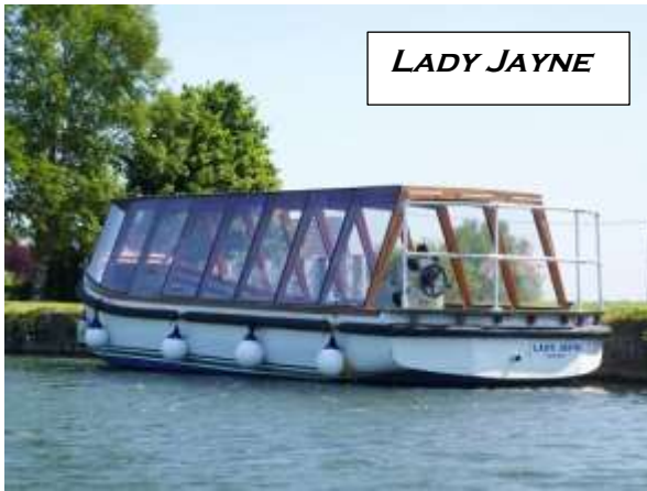
Lady Jayne can carry 12 people

In aid of the restoration and upkeep of the historic Driffield Canal