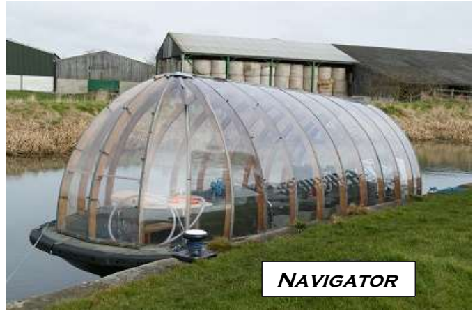
Driffield Navigator can carry up to 10 people