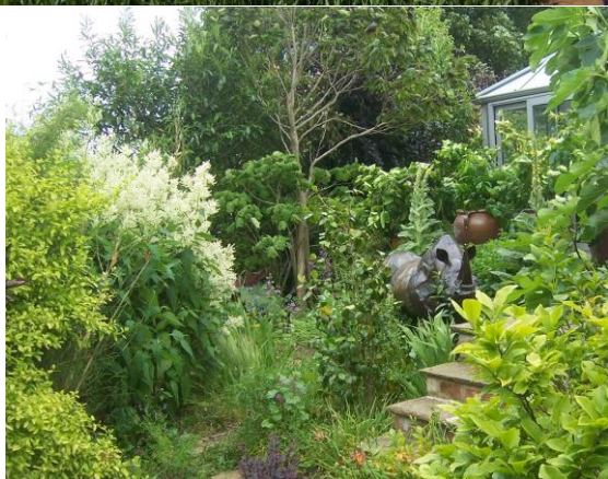
A well-attended Open Garden full of surprises and delight. Rev Grainger-Smith drawing the raffle.