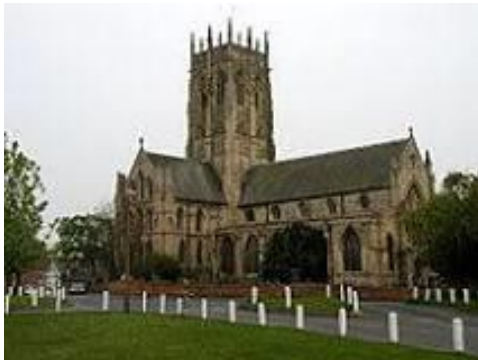
St Augustine's, Hedon