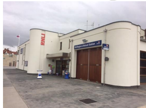
Bridlington Lifeboat Station

On a bright breezy Sunday morning in January, there was a good turnout to meet at the Park & Ride carpark this side of Bridlington. The walk was a straightforward “there and back” along the sea-front to Sewerby. Several of the group had done the walk before but there were some who hadn’t and they were very pleasantly surprised at how attractive the promenade now was. The recently-completed lifeboat station was in a style that complemented the refurbished Bridlington Spa and also the Leisure Centre and the effect of the regeneration was very impressive. Walking on past the harbour, the group paused for lunch in the grounds of Sewerby Hall and then wended their way back in an increasingly stiff breeze.